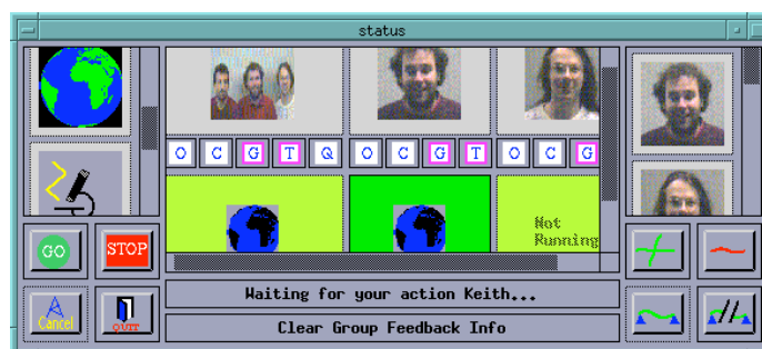
Figure 1: GUI for providing increased levels of awareness.

The session manager's GUI, shown in figure 1, uses coloured icons to provide feedback to group members regarding the state of connectivity within the group and the violation of any QoS requirements. For example, a disconnected group member's icon would be displayed with a red background, while a connected group member's icon would be displayed with a green background.