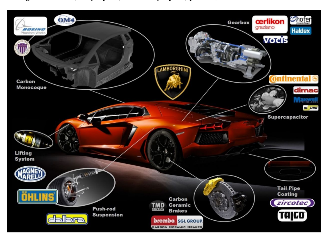
Figure 2: Aventador embedded case studies components and companies