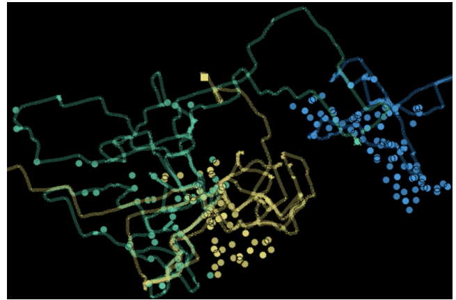
Figure 2. The overlap of 3 of the rounds in the city on 25th October 2016. This demonstrates how delivery rounds from 3-5% of all carriers working in this area use the same roads and deliver within close proximity. (Blue is B2B, Yellow and Green are B2C). Circles represent deliveries and collections

Of the time spent on a delivery round, the time that is spent walking can be more than that of driving (D7, D20, D21, D22). Walking, and walking strategies are one of the keys in effective last-mile parcel deliveries. Reducing the time that the drivers spend in vans helps improve their per-parcel efficiency (see Figure 2). It is clear from our findings that a larger distance of walking correlates with more parcels delivered quicker, and that walking is key in helping drivers perform better and reducing environmental impacts and negative externalities. Figure 2 shows that the geographic area in which these rounds operate can overlap significantly, for only three rounds. The same areas are being delivered to throughout the day by different drivers, from different couriers. This overlap in space and time highlights an inefficient use of the street in terms of road use (congestion), curbside stopping (stopping at the same places). Not only is this clear for the roads used, there is also clear overlap in where the drivers are making deliveries, with a considerable number of deliveries being