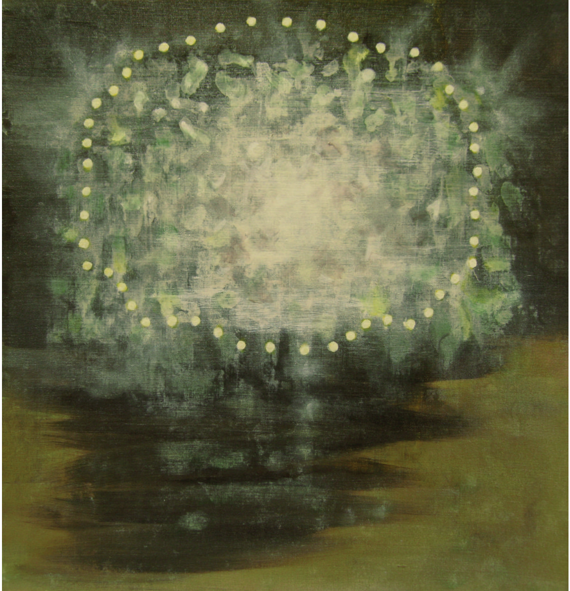
Secret Life of Mirrors , 2017, oil on canvas, 52.8 cm x 50.1 cm