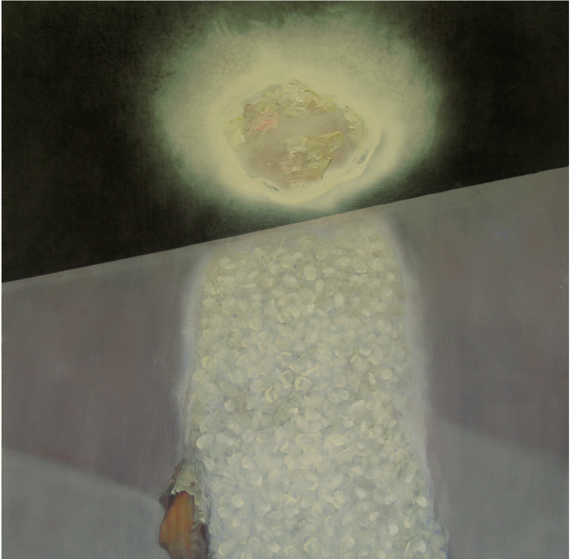
Dreaming Girl 7 , oil on canvas, 92 cm x 91.5 cm