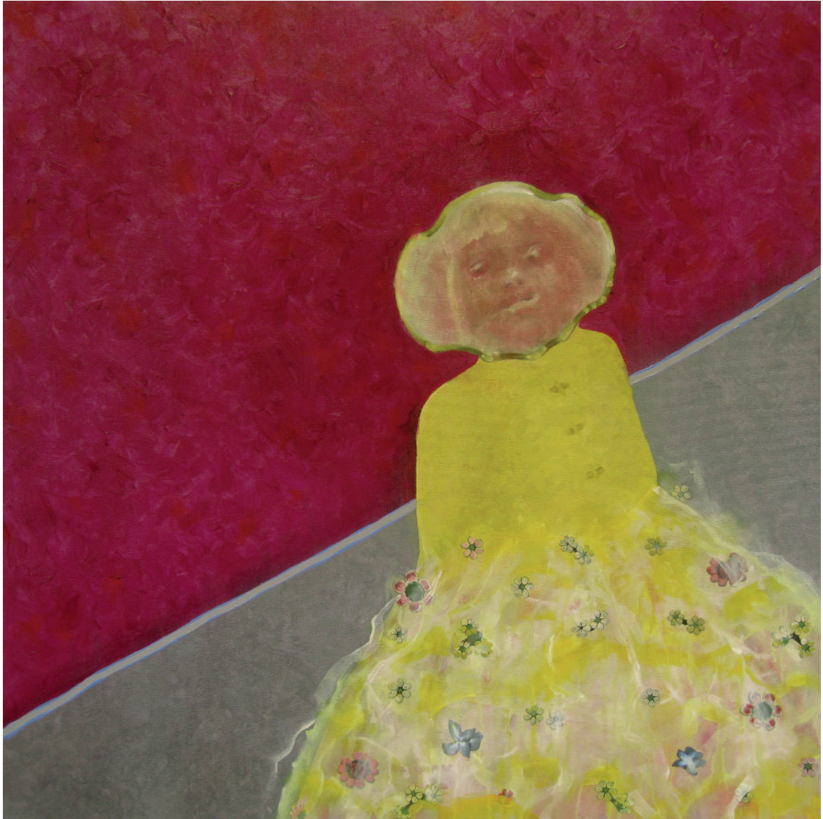
Dreaming Girl 1 , 2017, oil on canvas, 90 cm x 90.5 cm