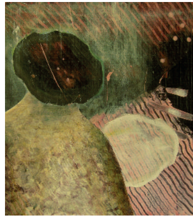
Whilst Olympia Sleeps , 2017, oil on canvas, 53 cm x 48 cm

In Orpheus (1950) Jean Cocteau presents an hypnotic example of the mirror's filmic potential. In this retelling of the Greek Myth, Orpheus is a poet who puts on a pair of magical gloves, which enable him to pass through a mirror into the underworld in search of his dead wife. We follow on through the camera lens. This unforgettable scene bridges our reality and a metaphysical world beyond the mirror. Cocteau's guardian of this underworld tells us of the inevitable loss that accompanies this transition, 'Two worlds struggle to coexist, the world of life and the world of death'.