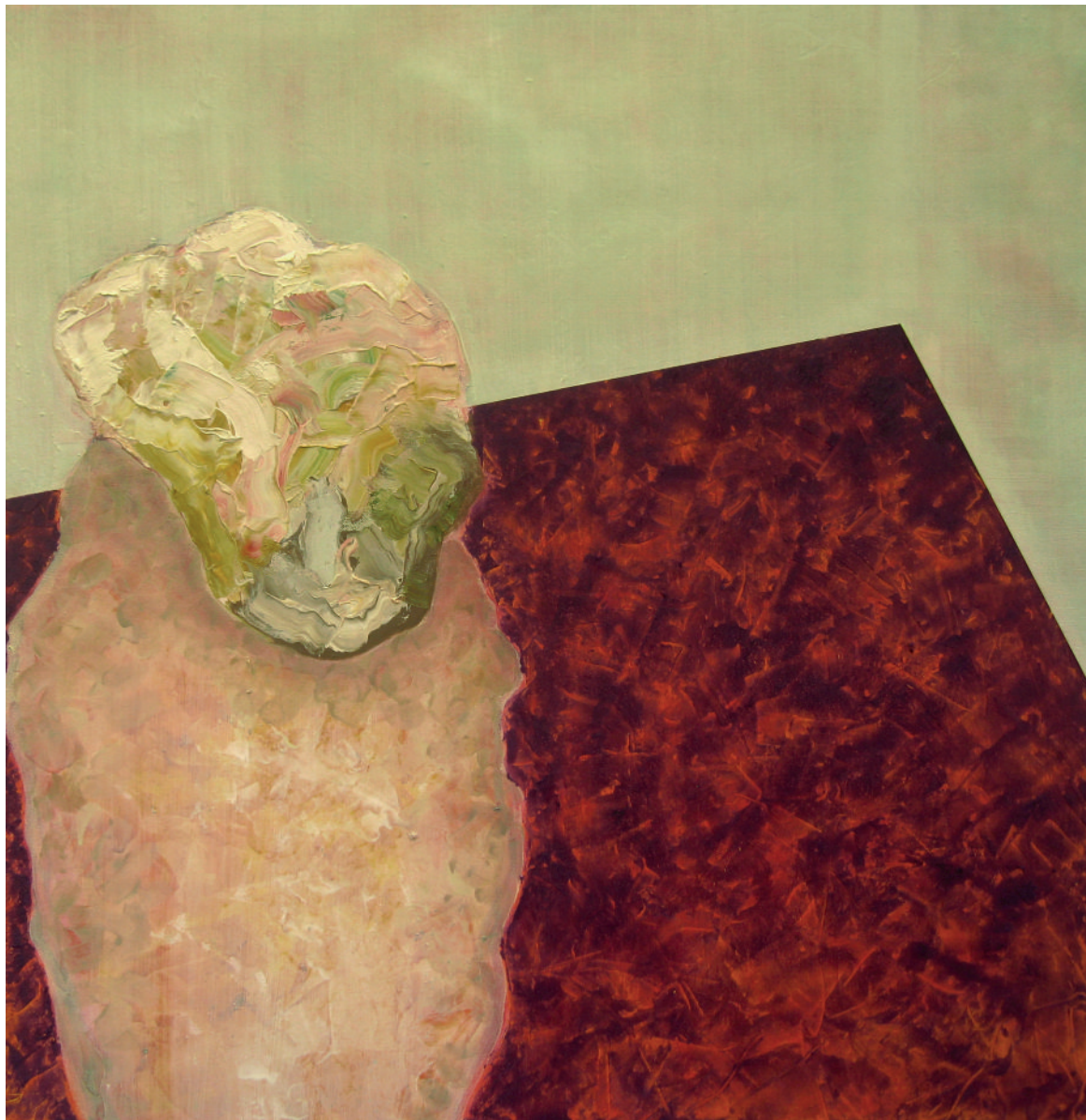
Mirror Head 2 , 2017, oil on canvas, 78.5 cm x 76.5 cm