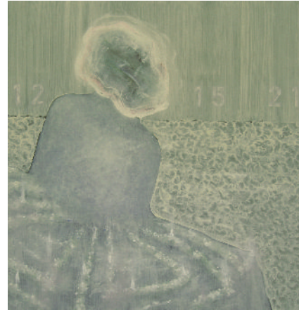
Dreaming Girl 3 (Infanta) , 2017, oil on canvas, 79.4 cm x 76.1 cm

to a puzzle, he accepts that some paintings are a starting point for speculation with no possibility of completion. Paintings of this kind may require a different approach to looking at them, one that accepts that they cannot be read or understood in a logical framework and our