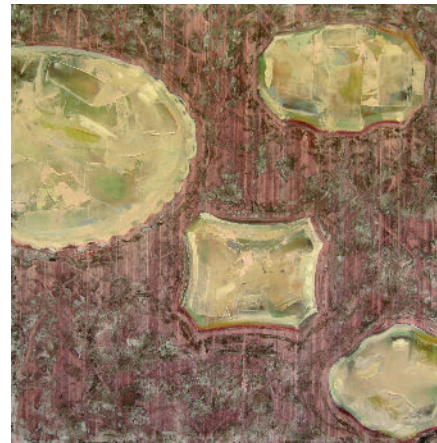
Family , 2017, oil on canvas, 79 cm x 78 cm

disappointment of self-reflection; in short, psychological other .