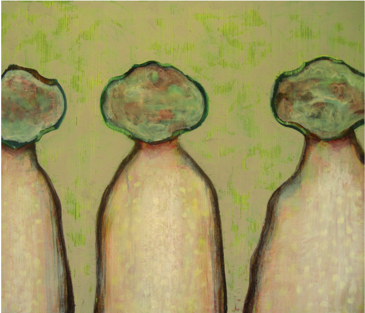
The Circle , 2017, oil on canvas, 66.6 cm x 76.5 cm