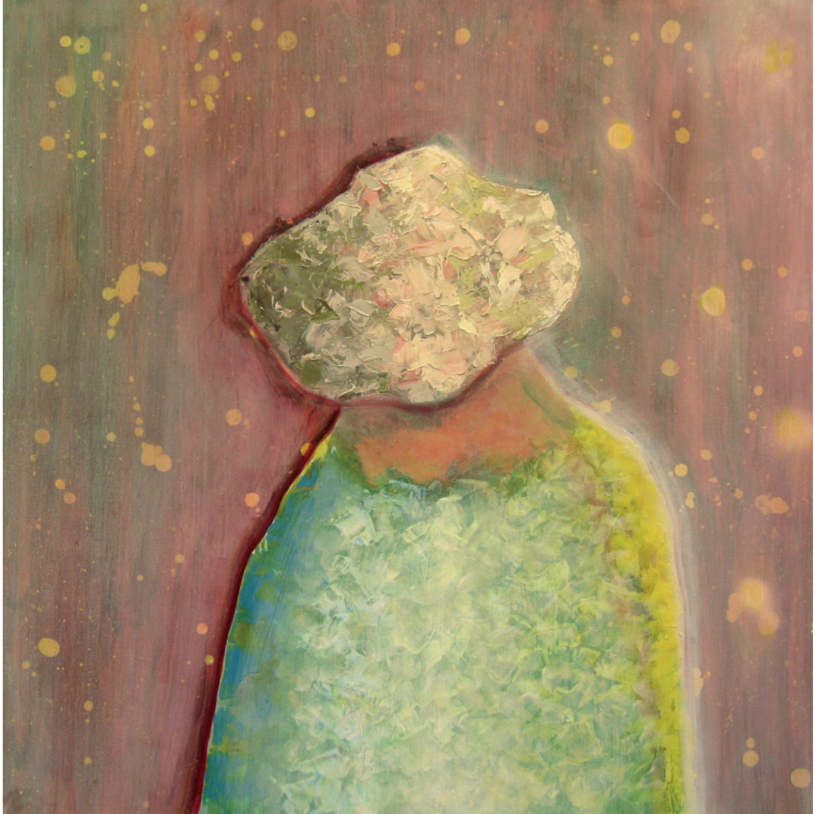
Dreaming Girl 5 , 2017, oil on canvas, 78 cm x 77.5