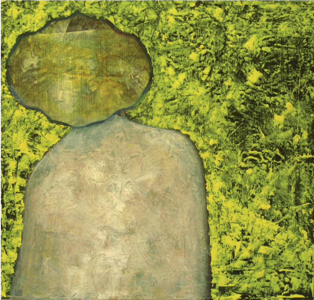
Dreaming Girl 6 , 2017, oil on canvas, 49.6 cm x 52.2 cm