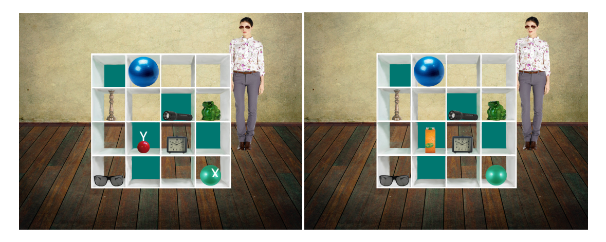
Figure 1 Left: an example stimulus from an experimental trial. Right: an example stimulus from a control trial.

blocks. Four running versions of the experiment were generated by rotating the order of the blocks and by reversing the presentation order of the shelf-images. At the end of the test phase, children were given a participation certificate and a sticker.