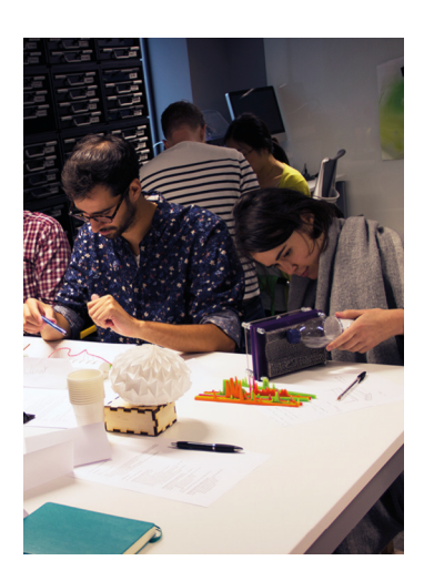
Figure 3: An impression of the co-creation session.