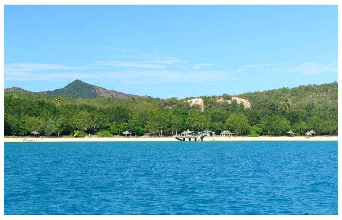
Figure 3: Mouac island

It was P&O Cruises Australia, working with the local company 'Poum Adventure', that organized a cruise ship program in the bay. In 2003 a committee was created which brought together the Boaouva and Dayé clans. The committee was responsible for maintaining beach facilities on Mouac Island (Figure 3), organizing activities in the 'Shelloh village' in the administrative centre of Poum (dancing, sale of handicrafts and food) and managing finances. In Poum, some cruise passengers were taken to see Titch and the administrative village. Others visited the mine by bus. On Mouac, the passengers stayed on the beach and had a large barbecue. In 2007, four P&O Cruises Australia ships came to New Caledonia making a total of 158 stops, 5 of which were in Poum. The committee received around 400,000 CFP (US$4,611) for each boat arrival from the tour operators. Since the cessation of activities in 2010, the infrastructure on Mouac and in Poum has fallen into disrepair (Figure 3), although in 2013 and 2014 the Shelloh site in Poum was used for the Shaxhabign cultural festival and a seafood event. <sup>38</sup>