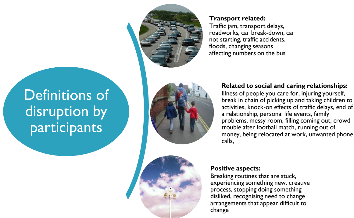
Figure 1, Definitions of disruption by participants.

As often assumed, disruptions are frequently perceived as negative, but they can also be experienced as positive, for example, changing routines that are stuck – disruptions inspiring a creative process, recognition of the need to change arrangements that appear difficult, experiences of something new, stopping doing something disliked, a theme that we will return to later in the report. The following sections draw out two of the key themes in relation to the characteristics of disruption to emerge from the data: that disruptions are part of everyday life and that they are social - dependent on and affecting relationships and experienced in different ways based on difference.