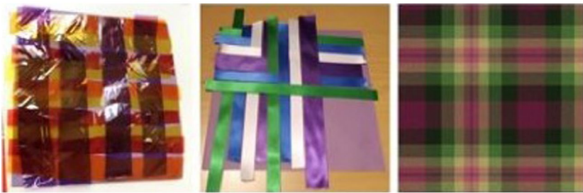
Figure 2. Tartan design creative process (left to right: acetate, ribbon and digital prototypes).

In recent years, the make up of co-design participants has evolved to ensure that those who will be affected by the design have a say in the process, rather than being just final users (Ehn 2008; Tunstall 2013). Today, participants are considered to be able to bring valuable