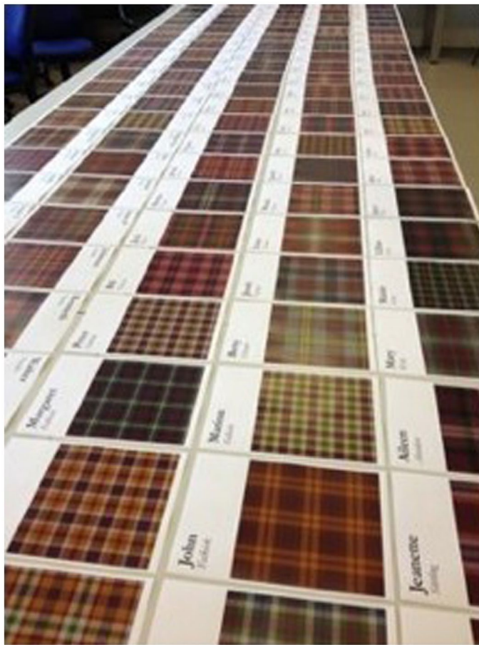
Figure 4. Over 130 designs for the new disrupting dementia tartan (judging and short-listing session).

Next, digital versions of the 7 short-listed tartans were uploaded and exhibited on the Alzheimer Scotland website— http://www.alzscot.org —for people to vote for their favourite tartan design. After more than 8000 votes were cast from across Scotland, the chosen Disrupting Dementia tartan was designed by Nan from Inverness. Nan's winning design has now been manufactured and the plan is to develop a range of tartan design products that will be sold all over the world (Figure 5). This project shows clearly that a person living with dementia has, with a little support, designed a new product—the new Disrupting Dementia tartan. As such, this co-design project goes to show that people with dementia can indeed offer much to society after diagnosis.