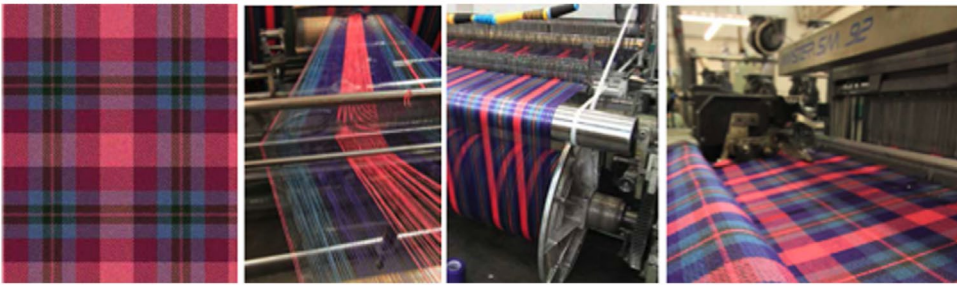
Figure 5. Production of the disrupting dementia tartan.

Reflecting on the co-design workshop sessions with more than 130 people living with dementia, it is abundantly clear that people living with dementia can offer much to society after diagnosis. On completion of the co-design project, a questionnaire was sent to