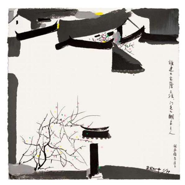
Fig. 40 Wu Guan Zhong A Corner of Jiang Nan (1999) Ink on paper 50 \times 50 cm ©Wu Guan Zhong & Huang Zhou Museum.

In China in 1919, Wu studied painting in Paris at the École Nationale Sup árieure des Beaux-Arts, starting in 1947,<sup>20</sup> in which landscape painting was influenced by a number of Western Modernist art movements. Wu's painting displays a style of simplicity, but powerful and unique, opening up both abstract and realist elements of art that he studied from the West and China. As Figs. 40 and 41 illustrate, his works are usually painted through some cross and rhythmic structures of line in combination with abstract visual elements, in which the painter represents his skilled combination and assimilation of both Chinese ink and the abstract language of Western modernist painting.