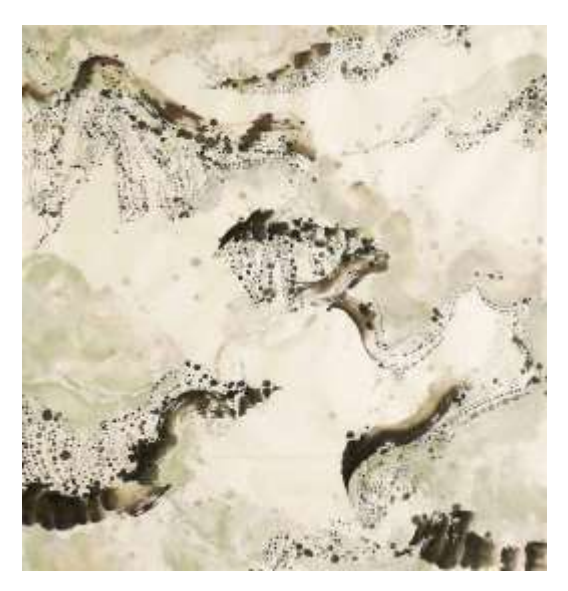
Fig. 53 Yuping Li Practice I , (2014) Chinese ink and watercolour on paper 70×75cm.