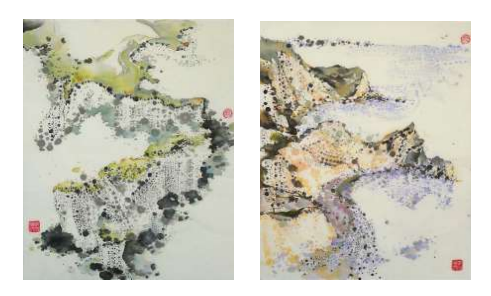
Fig. 31 Yuping Li Handfast Point between Studland and Swanage in Dorset (2014) Chinese ink and watercolour 45×38cm.