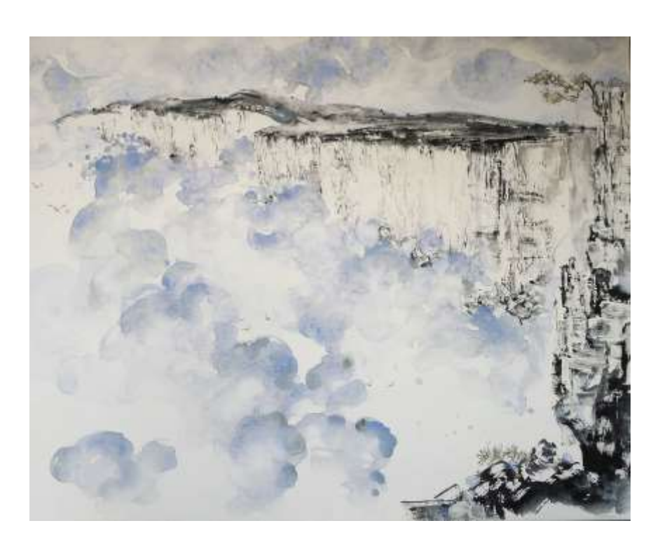
Fig. 36 Yuping Li Poem of Cliff and Cloud II (2014) Chinese ink, acrylic and oil on canvas 100×80cm.