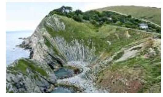
Fig. 27 Yuping Li Photo of Seven Sisters White Cliff (2014).