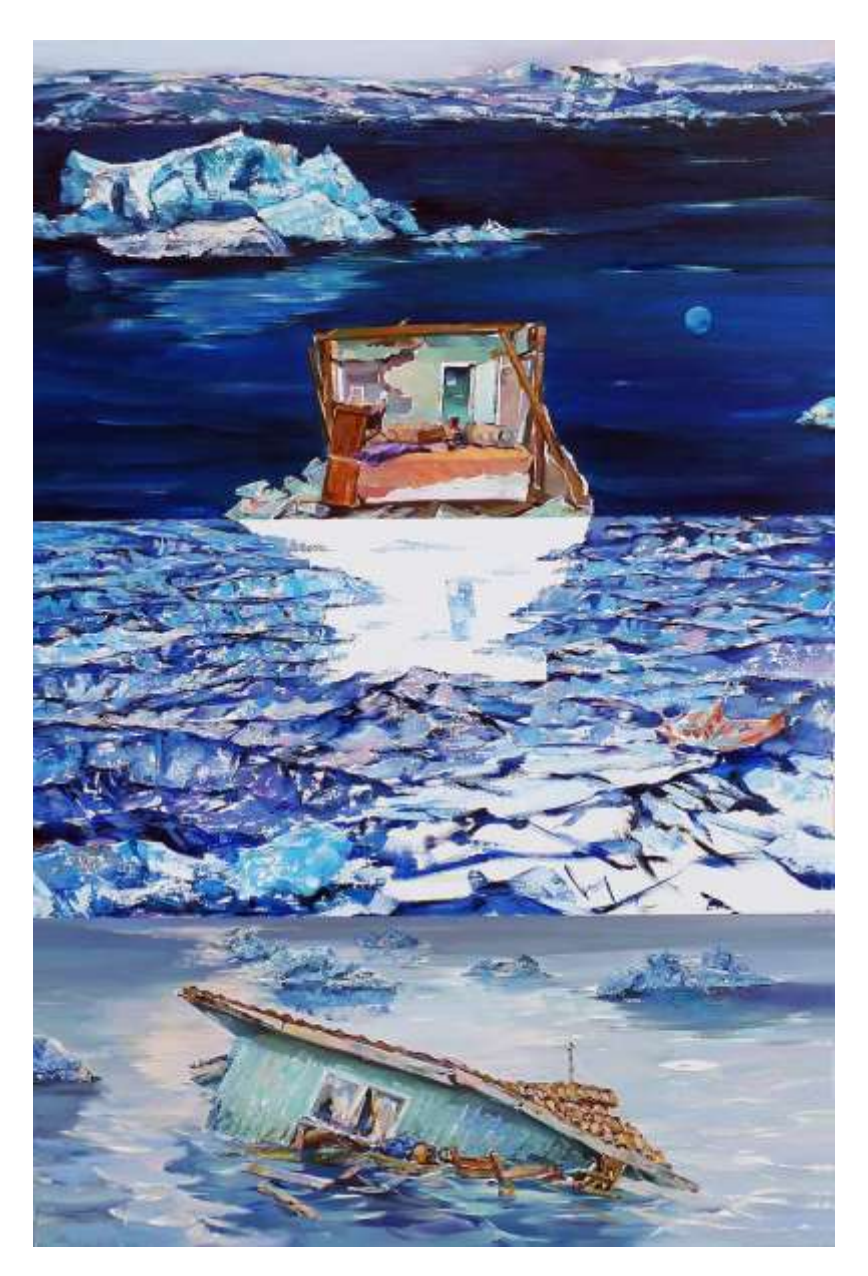
Fig. 12 Yuping Li Inhabitance No.3 (2016) Oil on canvas 120×80cm.

symbolic subjects via a certain perspectival spatial structure, I address an ideological state of tension, panic and uncertain mood beyond the appearance of landscape as a visual phenomenon.