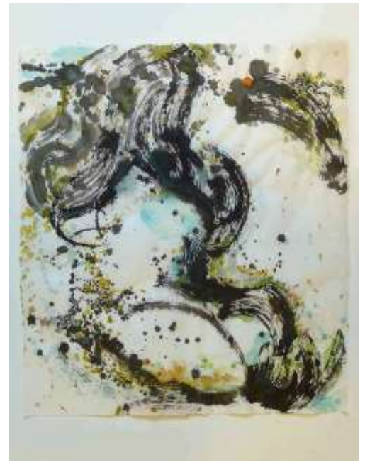
Fig. 57 Yuping Li Lulworth Cove along Jurassic Coast I , (2015) Ink and watercolour 48×45cm. Fig. 58 Yuping Li Lulworth Cove along Jurassic Coast II , (2015) Ink and watercolour 48×45cm.

This linear expression in my practice cannot be separated from its pictorial tool – the traditional Chinese pointed brush, which possesses a flexible ability to deal with any ink and water-based method of painting. Often made from animal hairs bundled together in tubular bamboo, the Chinese pointed brush can absorb the ink and water according to a certain proportion to express a variety of linear visual effects in association with the trained and skilled movement of fingers, wrist and arm. The diverse associations and contrasts of linear forms, soft or hard, round and square, smooth or rough, light or dark, indeed, provide a broad space for art as a spiritual expression that is also my practical pursuit in this study. Here, line is a main pictorial language to respond to a philosophic understanding of fullness in contrast with the infinite emptiness as a carrying space.