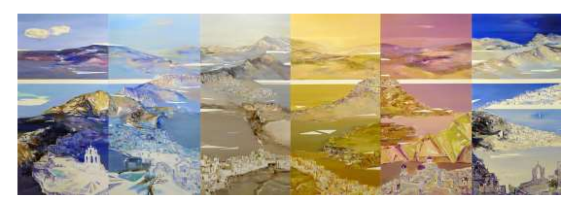
Fig. 39 Yuping Li Empty Moments (2015) Oil on canvas 100×50cm each by six panels.

In the later stage of my studio practice, I began to think about how to access Western oil materials and the perspectival spatial methodology of Chinese painting to explore the diverse space-time possibilities as a contemporary language of landscape painting. Empty Moments (Fig. 39) is a six-panel screen painting, representing a landscape journey in the Greek island of Santorini during one day. This series screen painting has been exhibited in the LICA PhD group show In-Betweenness in November 2015. Most of my studio paintings around this period explore the spatial possibility in a cross-cultural fusion, and particularly concern the time duration that can be reflected in forms of landscape painting. For example, in Fig. 39, I emphasize the time passing during a day from early morning to night; while in Fig. 15, I address a process of seasonal change on a range of geographic features of landscape.