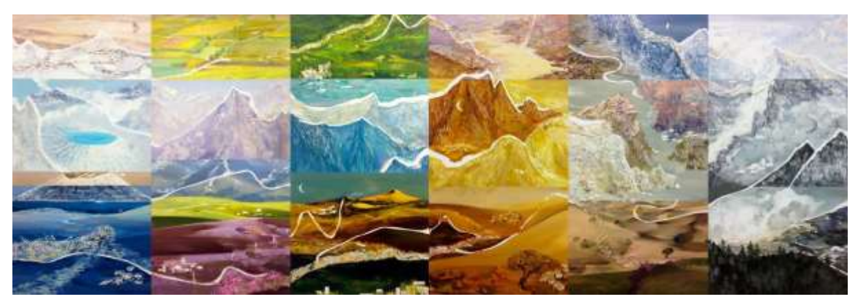
Fig. 15 Yuping Li The Cultural Geographic Landscape (2015) Oil on canvas 100×50cm each by six panels.

This screen work aims to demonstrate a spatial state in which a landscape has formed through the development of time, the cultural combination and the form of art display. Visual authenticity in the work is different from the representation of physical reality that the eye can see once, like the traditional Western oil painting. Daoism understands the term Zen as an intrinsic quality of objective things. Its authenticity reflects an ideological state to comprehensively perceive the various aspects of nature, rather than a visual moment of landscape. The single space-time state is not the point of my emphasis, rather, the changing space, scenes and different colours represented in the work all suggest a process of movement of the land – the birth, development and recession of nature. Here I focus on creating a balance between the physical and spiritual reality of nature. Like the ancient Chinese landscape pursues a harmonic order to express natural spirit, this practical screen work was painted in an aim to evoke the thought towards an eternal state of natural movement that goes beyond the work itself.