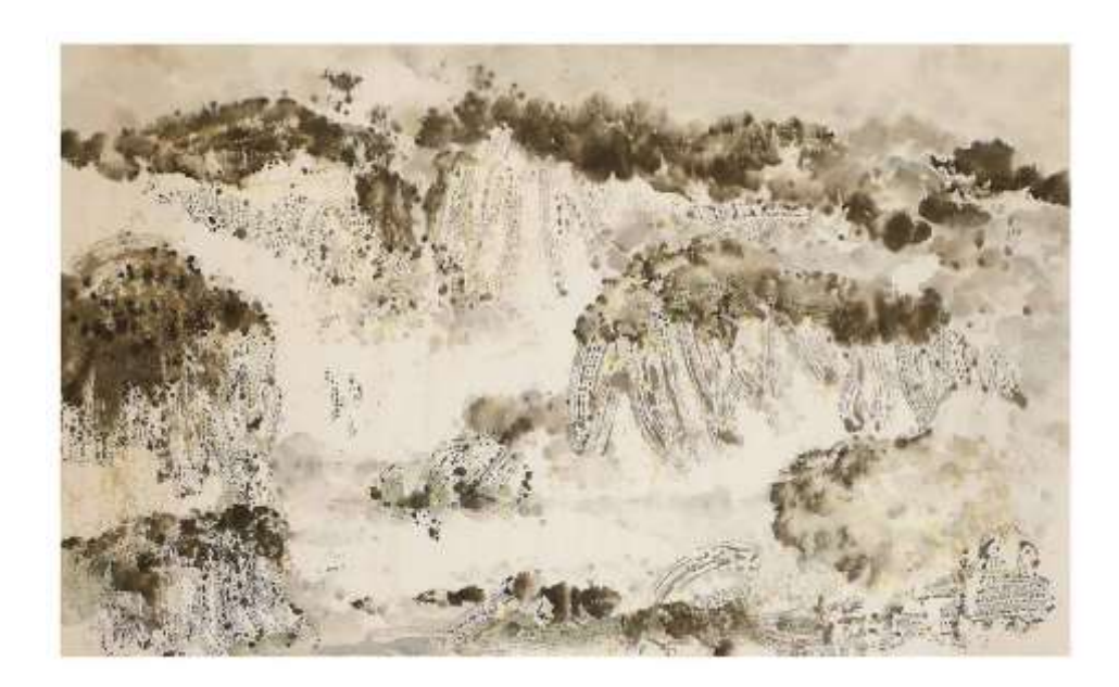
Fig. 33 Yuping Li Formation of the Cliff I (2014) Chinese ink and watercolour on paper 70×120cm.

a different aesthetic quality that implies the cultural symbol of traditional China.