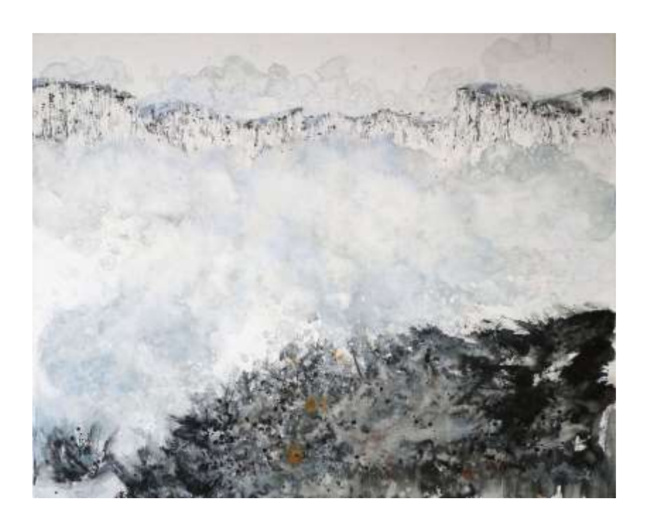
Fig. 35 Yuping Li Poem of Cliff and Cloud I (2014) Chinese ink, acrylic and oil on canvas 100 \times 80 cm.