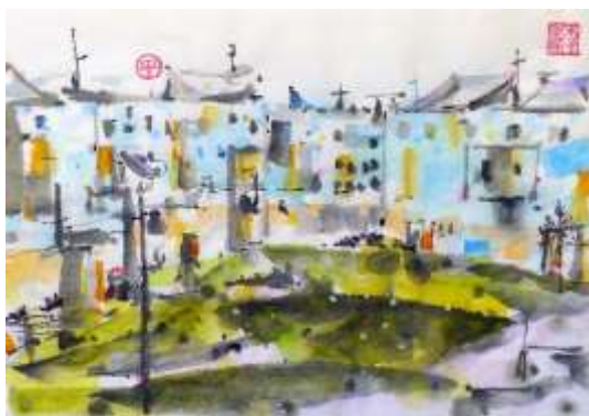
Fig. 60 Yuping Li Ruskin Library (2014) Ink painting 24×38cm.