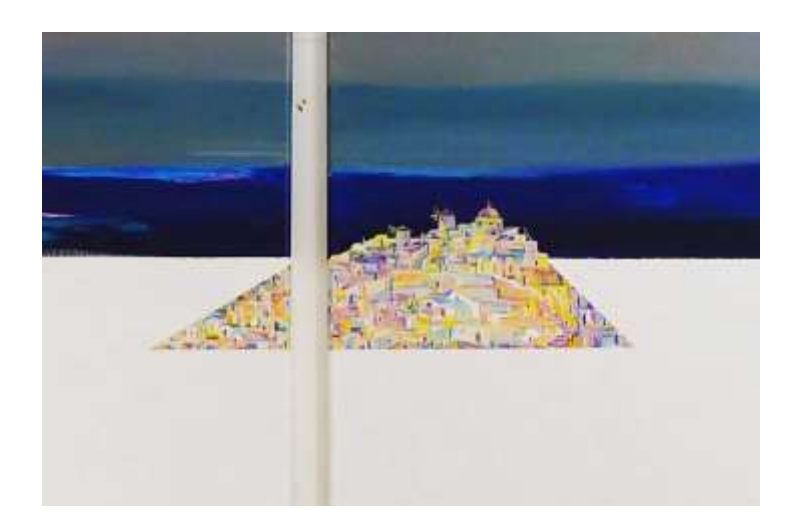
Fig. 64 Details of The Rootless Origin.

foreground, the work (Fig. 63) represents a gradual change of environments and scenes: the sea, desert, drought area, and the phenomenon of land subsidence and ships stranded. I believe these visible contents and symbolic scenes provide good references for the viewer's imagination towards the meaning of the empty space in this work. Here, emptiness is practiced as both the context and subject matter. For the scenes of the sea and desert in the background, emptiness is an imaginative subject – a 'floating landmass', an 'iceberg', or a 'Noah's ark' that is unable to dock anywhere; but for the small triangular town, emptiness provides a ground or a platform as a context to provide the means of existence of the town. Emptiness, in its unlimited possibilities of form and being, is used as a visual carrier to unite and transform the contradictory spaces represented in the painting.