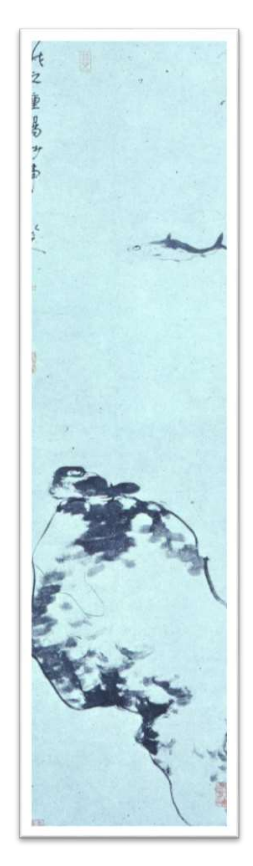
Fig. 43 Pan Tianshou Fish and Brid (1958) Ink on scroll 149 x 40.5cm ©Pan Tianshou & Chinese National Art Gallery.