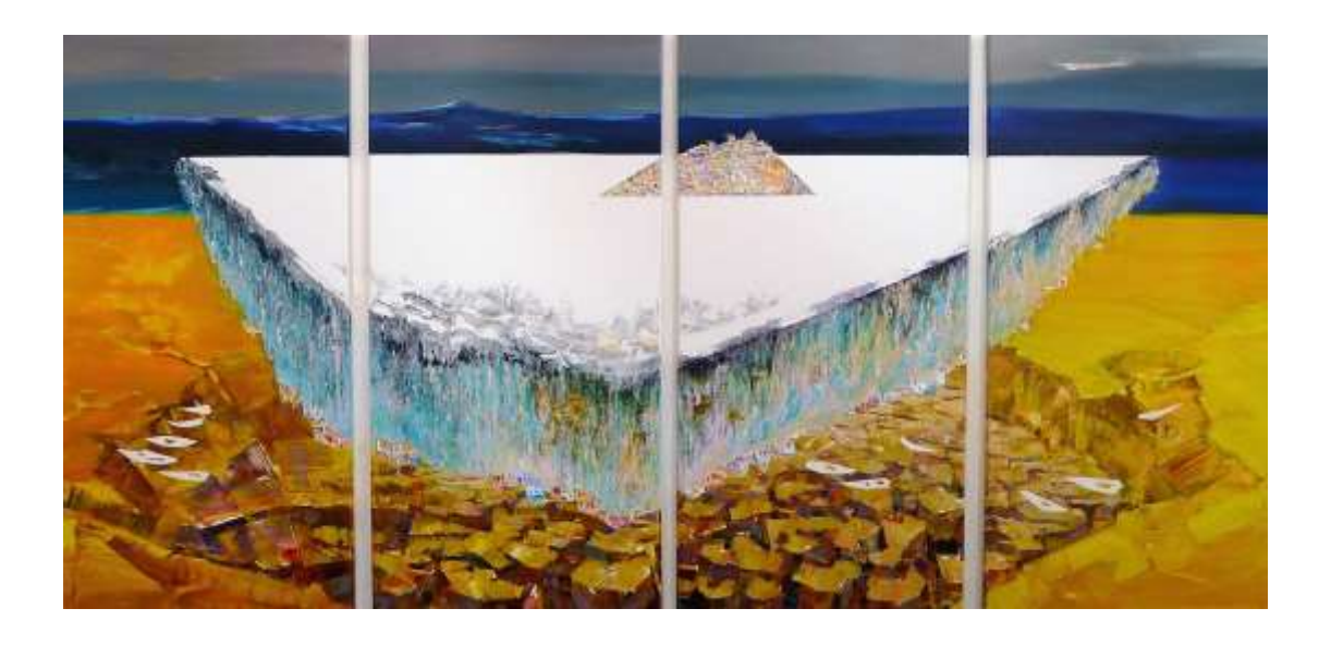
Fig. 63 Yuping Li The Rootless Origin (2015) Oil on canvas 100×50cm by four panels.

The Rootless Origin (Fig. 63) shows a slightly different mode in my screen series works, in which I use the blank space as a part of landscape's symbolic representation to evoke the metaphorical meaning and a method of making the complex cultural implication. This four-part work is related to the theme in another of my group paintings (Figs. 12-14) that concerns the potential climate change of our time and the crisis and tension between man, dwelling and the environment. In the work (Fig. 63), I attempt to challenge an unconventional composition, and concentrate the empty space right in the middle by an inverted pyramid to create a sense of 'an original and missing land'. This is to respond to the ancient Chinese philosophic definition that emptiness is an original status of the cosmos – a supreme emptiness before the world began to change.