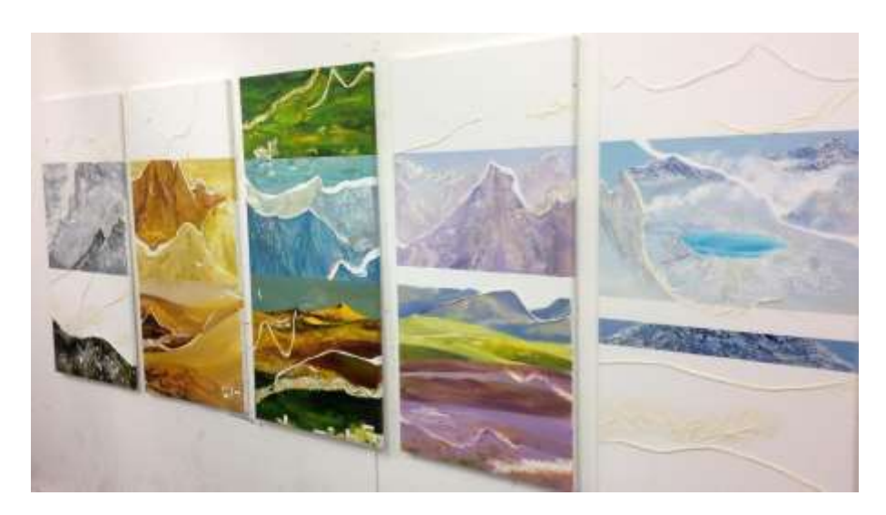
Fig. 16 Yuping Li Photo of The Cultural Geographic Landscape (2015).

expression of the broad geographic features, but also the cross-cultural methodologies practiced in my studio exploration. For example, I reference the way of perspective in traditional Chinese scroll painting, particularly on the Chinese Song Dynasty painter Guo Xi's spatial theory—making landscape through 'three levels of distance' to connect the different scenes as well as the process of viewing. In the work, each panel of painting has a 'multi-focus' perspective with a movable viewpoint to bring the viewer's eye up to down on the pictorial plane. At the same time, this six panels' combination creates a left to right process of reading and experiencing nature's change and development during a period of time. It is more like enjoying a visual landscape journey of the natural beauty and associated features of mountain and water through a process of seeing. Fig. 16 demonstrates a studio painting process in which I attempted to practice the different scenes and perspectival spatial method in different steps.