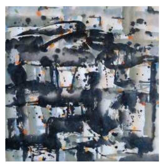
Fig. 55 Yuping Li Cliff Surface Practice I , (2015) Chinese ink and watercolour on paper 48×50cm. Fig. 56 Yuping Li Cliff Surface Practice II , (2015) Chinese ink and watercolour on paper 48×50cm.