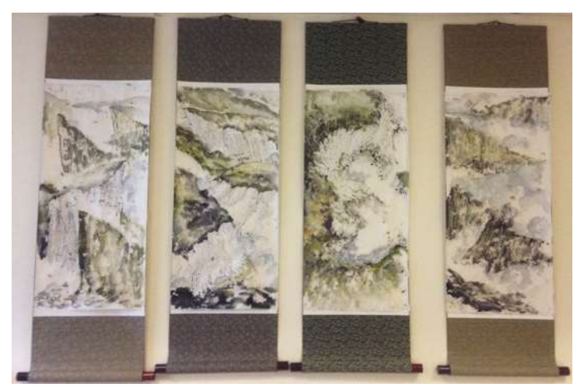
Fig. 26 Yuping Li Four Scroll Painting Practices (2014) Ink and watercolour on hanging scroll 33×113cm each.

Chinese perspective where the support is frequently a narrow and vertical form of the pictorial plane. Also, through representing a various range of scenes in each scroll painting, I attempt to demonstrate how I understand Guo's aesthetic claim about landscape's perceptual authenticity, and his spatial strategy by dividing the different levels of distance and depth in the work.