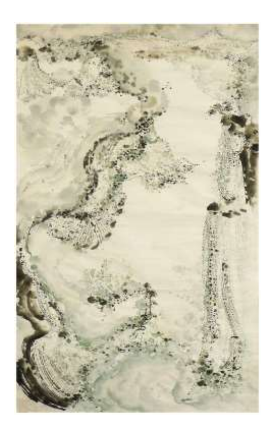
Fig. 34 Yuping Li Formation of the Cliff II (2014) Chinese ink and watercolour on paper 140×70cm.