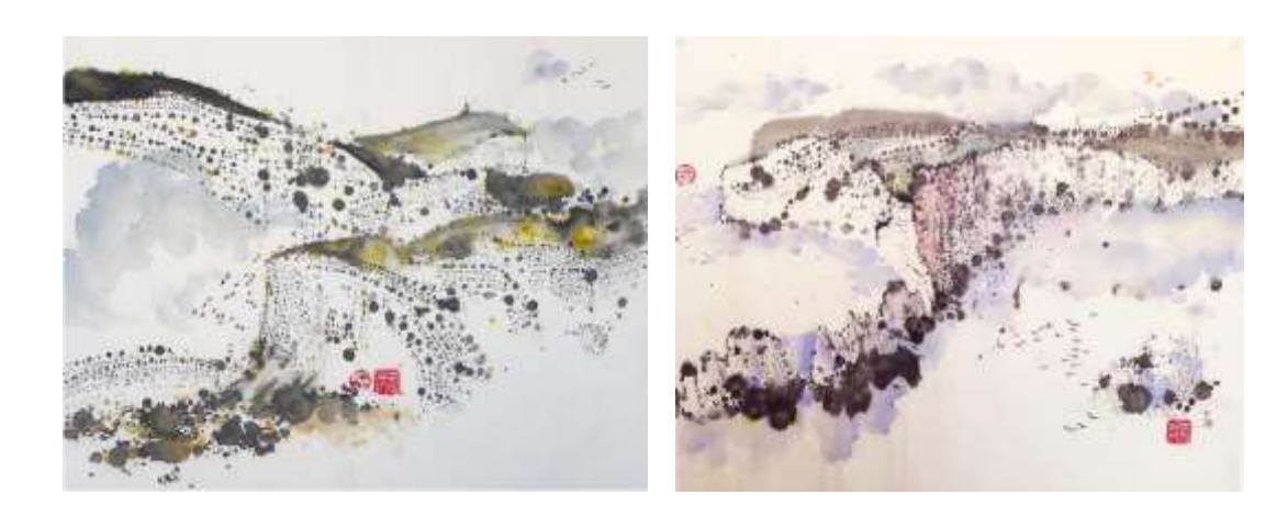
Fig. 29 Yuping Li White Cliffs of Dover (2014) Chinese ink and watercolour 38×45cm. Fig. 30 Yuping Li The Purple Melody (2014) Chinese ink and watercolour 38×45cm.

this way sees things through the physical appearance rather than the spirit, and restricts a free expression of ink and brushwork on paper. Guo's spatial strategy here is a better way to connect the different scenes, spaces and the process of viewing, providing a rich visual experience of landscape that I aim to display in the works.