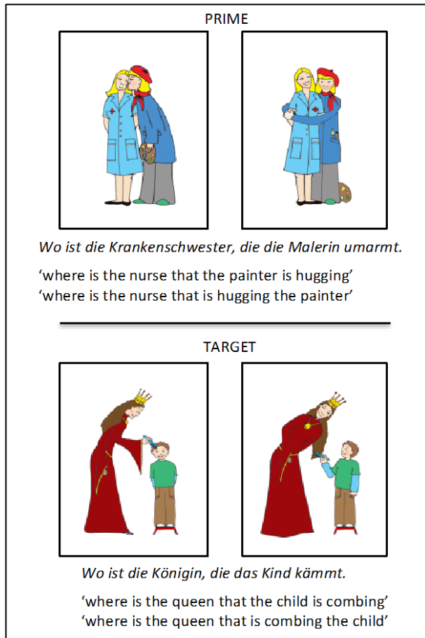
Figure 2: Ambiguous primes