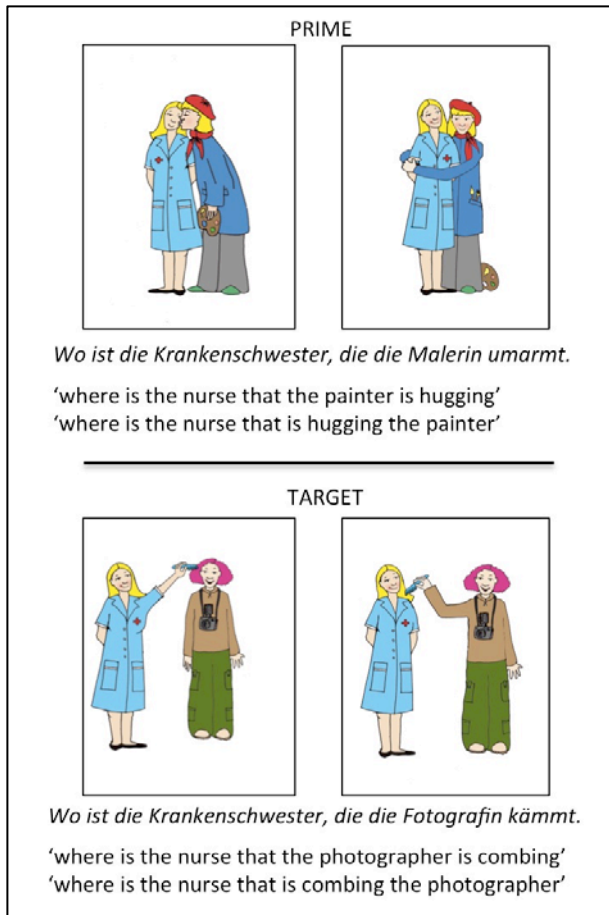
Figure 4: NP1 Overlap