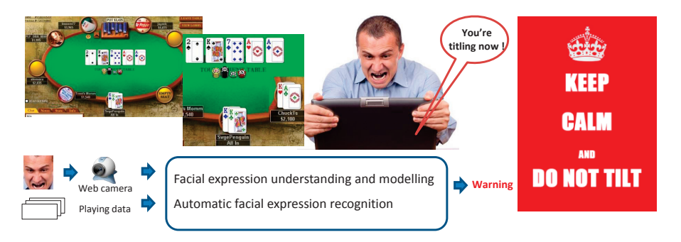
Figure 2: Illustration of poker tilting and automatic detection.

lost resources [16, 17]. This was a particularly common behavioural pattern in inexperienced players. The etiology and phenomenology of tilting is aptly depicted in a model formed by Palomäki, Laakasuo, and Salmela [17], which is based on a qualitative analysis of poker players' self-reported loss-induced emotions (see Figure 1).