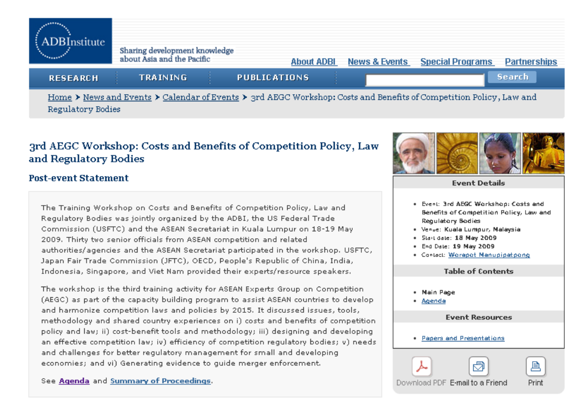
Figure 3: The 3<sup>rd</sup> AEGC Workshop on Competition Law/Policy 2009