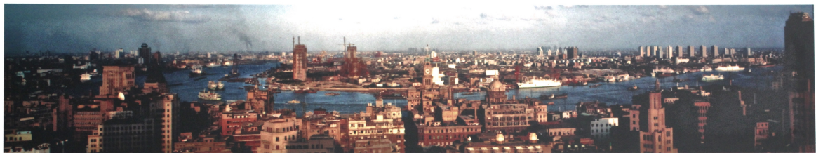
1990年代陆家嘴建设初期 The initial construction of Lujiazui in the 1990s