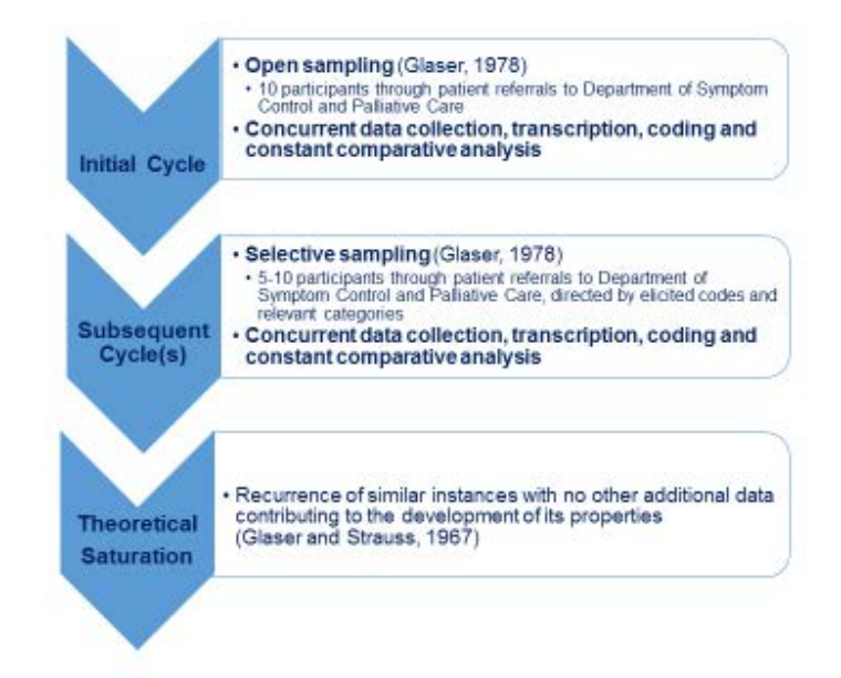
Figure 2. Flow Chart of Theoretical Sampling for Study

Using a classic grounded theory approach (Glaser, 1978), this study aims to develop new mid-level range theory through the triumvirate of constant comparative analysis using theoretical memos, theoretical sampling, and theoretical saturation (Coyne, 1997) (see Figure 2):