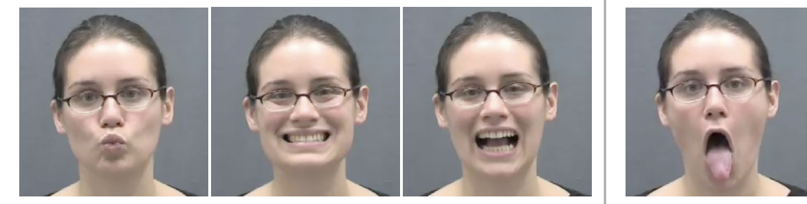
Sequential Movement: Round lips, then spread lips wide, then bring teeth together