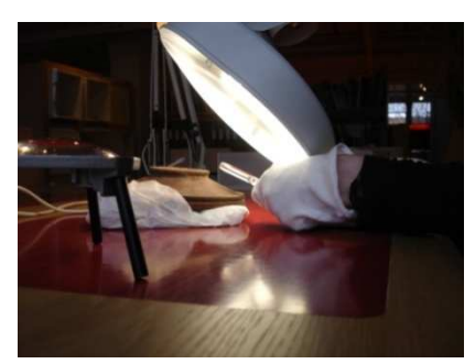
Fig. 1 Working in archives

surrounding visibility and damage. The agenda was kept as open as possible with the purpose to really look and find out what went on. I would work through the available equipment or use the limitations of the environment to determine the way that studies were made (Fig.1). For example, in the case of costumes archives, the drawings were dictated by the need to wear gloves and work in pencil.