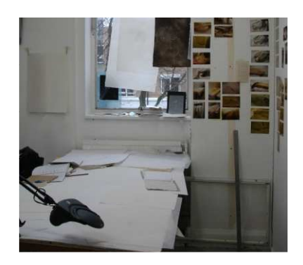
Fig. 2 Testing in the studio

The "drawing" became a means of making connections between seemingly disparate material. Through testing the aesthetics of these processes, visual and conceptual elements began to emerge that were common to all case studies, for instance: (in)visibility, control, light, damage, or distancing: the wearing of gloves being a prime example of the latter. The question became: how might these elements be developed into a coherent body of work that would comment on the information gained? To illustrate this concept more tangibly, I will focus on the development of one particular series of work: Patina .