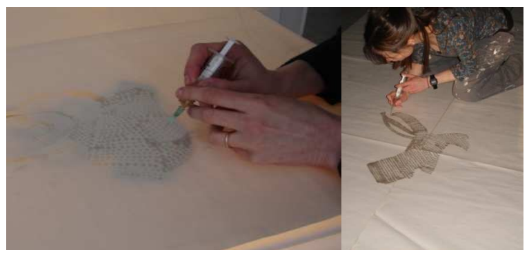
Figs. 3 & 4 Making the Patina series.