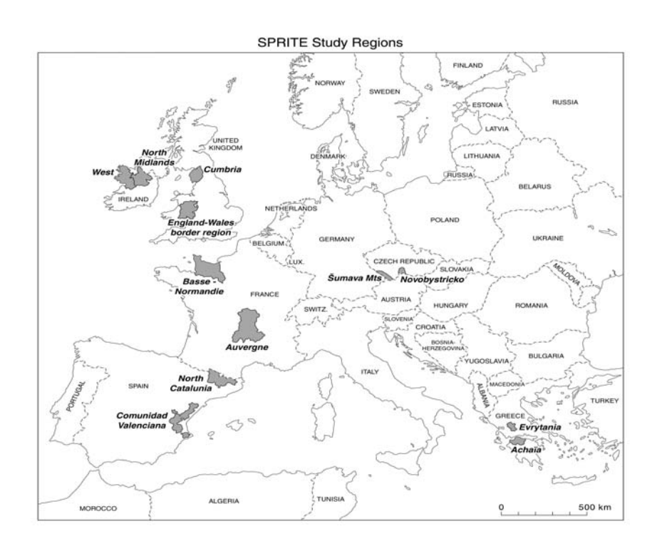
Figure 1. SPRITE study areas: countries, regions and sub-regions