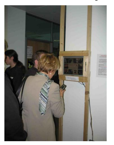
Figure 1. InfoLab visitor interacting with the Hermes Photo Display (March 2006).

A brief user trial was carried out in March 2006 (see Figure 1 below) in which the system was used in an unprescribed fashion by a small number of visitors to the Computing Department. As you might expect, users spent some time matching up the grid pattern shown on their mobile phone with the grid pattern shown on the display, but users were able to complete selection and downloading tasks.