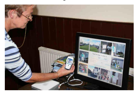
Figure 2. Bluetooth Interaction with the Wray Photo Display (March 2006).

In parallel with our explorations into synchronous interaction methods, we have also explored alternative domains. One of these is a photo display for a rural village nearby to Lancaster called Wray [Taylor, 2007]. In our early deign sessions with our user group from the Wray (members of the village 'Computer Club' with varying levels of computing skills) we discussed idea of a photo display for the village based on something similar to the Hermes Photo Display. We also discussed the idea of supporting the uploading and downloading of pictures to the photo display via mobile phones and the idea was greeted with some enthusiasm. Consequently, we developed the Wray Photo Display to support this feature. Figure 2 shows the leader of the Computer Club 'playing' with this feature when the first version of the display was ready for an initial deployment in the Wray village Hall in August 2006. The interface displayed on the Wray Photo Display screen is shown below in Figure 3.