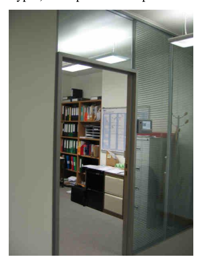
Figure 4. The Hermes II Office Door Display (taken March 2007).

The Hermes system was dismantled in July 2004 and working prototypes of a new version of Hermes (Hermes 2) were deployed in the new department building in May 2006. A full deployment across two corridors and 40 offices is currently being completed. From the user's perspective, one significant change from the original Hermes system is the use of a larger 7 inch widescreen display. This larger screen was chosen by the majority of door display owners from the original Hermes system during a 'show case' study in which a variety of display options (based on high fidelity prototypes) were presented to previous owners.