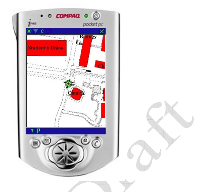
Fig 1: The Genie's navigation screen. In this case the tourist is approaching a church.

Navigation support is delivered via a geocoded electronic map. In essence, this is an electronic image of an appropriately scaled map that has been tagged with such information as facilitates the swift resolution of a GPS position into its corresponding point on the electronic map. The map itself, supplied by the local municipal authority, shows routes and buildings. However, any item that is of likely to be of interest to tourists has been highlighted and labelled (Fig. 1). As the tourist explores their environment, their position and orientation on the map is highlighted and continuously updated. In this way, they can see their position relative to the various attractions at a glance. The option of explicitly scrolling the map is also available.