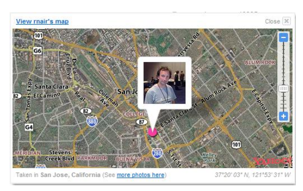
Figure 1. Example of a zonetag image geolocated on a Yahoo! map.

There is currently much interest in the area of spatial representations of media and how such representations can lead to new forms of interaction, e.g. the recent CHI workshop on Mobile Spatial Interaction (http://msi.ftw.at/). The utility of web2.0 services to provide tools and services to support the geo tagging of media such as photos (e.g. www.flickr.com) and systems such as zonetag (zonetag.research.yahoo.com) enable a photo captured by a camera phone to be uploaded to a social site such as Flickr. Figure 1 illustrates how zontag presents a geotagged photo on a Yahoo! map.