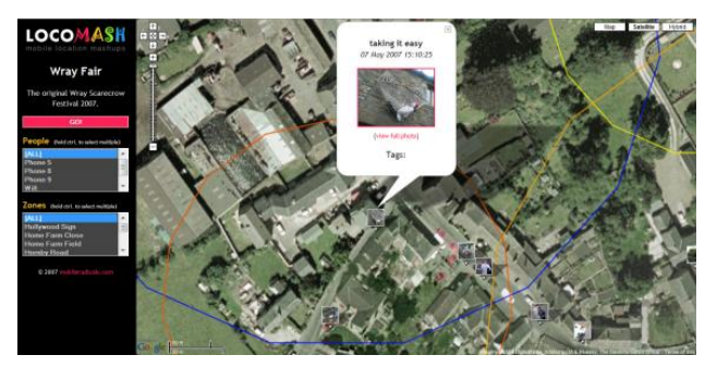
Figure 4. A screen shot taken during the Scarecrow Festival event – 7<sup>th</sup> May 2007

A sample screenshot from a view of the Wray LocoMash is shown below in figure 4 and the fully populated mashup can be accessed from the following URL: http://www.locomash.com/view-event.php?eid=2.