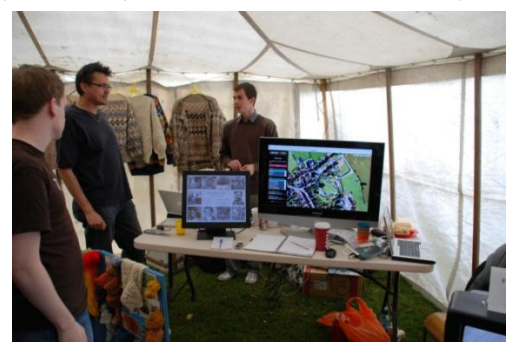
Figure 3. Setting up the exhibit in the 'Big Tent' in May 2007.

In order to gain early feedback regarding our approach we conducted a formative study using an exploratory prototype on one day of the Wray Scarecrow Festival on the 6<sup>th</sup> May 2007.