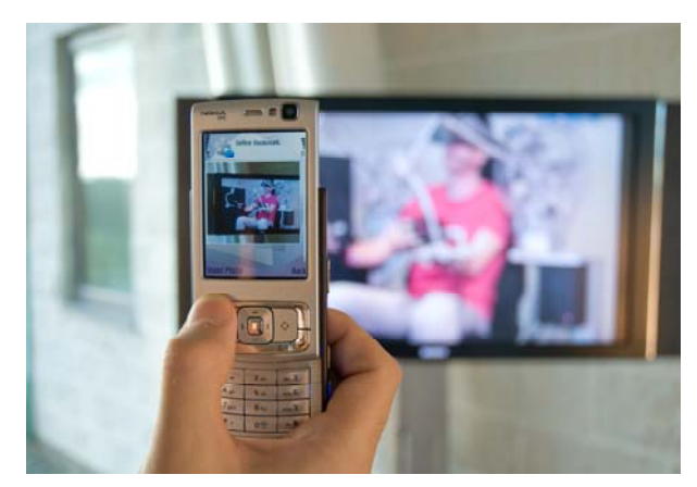
Figure 2. User aiming at a display with a Nokia N95 to create a Contextual Bookmark.

To enable users creating bookmarks using a mobile device, a Java ME (MIDP, CLDC 1.1) application running on recent camera phones (e.g. the Nokia N95 equipped with an integrated GPS receiver and a high resolution camera) was implemented. The application provides the user interface to access the intended functionalities. While aiming with the camera at a poster or a public display showing videos, a user selects the create bookmark function from the application's menu. On the phone's display the user can see the view of the camera as shown in Figure 2. When pressing the shoot soft key, a photo is created and annotated with additional contextual information (e.g. time and location). Two examples of created photos are shown in Figure 3. The photo as well as contextual information is transmitted to a recognition server via a TCP/IP connection using a wireless network (e.g. a 3G connection or Wi-Fi).