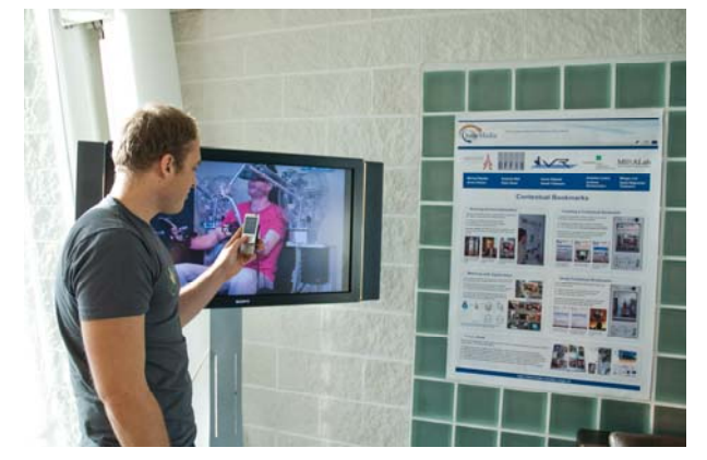
Figure 5. User interacting with a basic setup of the Contextual Bookmarks system comprising a display and posters.

Like the user interacting with a basic setup of the demonstration