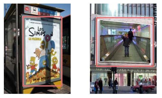
Figure 3. Photo of a poster advertising the Simpsons movie and photo of a public display showing a video.

robustness of the recognition. To compare a photo with a poster or video, SIFT keypoints of the photo are compared to SIFT keypoints of the poster or video. A Best-Bin-First heuristic [7] on a KD-tree is used to reduce the complexity. In about a second, the approach is able to compare a photo with a few minutes of video or a few dozen posters in about a second. In order to address a higher number of videos and posters, the number of considered object must inevitably be further reduced.