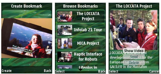
Figure 4. The Contextual Bookmark prototype on a Nokia N95. Left shows the view of the camera, centre a list of created bookmarks, and right the details of a bookmark.

on setup. The system will be capable to recognize two posters that present our ongoing research. In addition, pre-processed videos shown on a computer screen can be used to create Contextual Bookmarks. Another computer will serve as a HTPC that can be used to shows bookmarked videos.