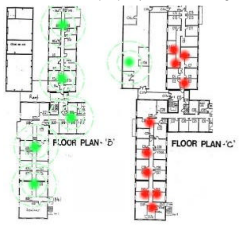
Figure 6: Location of Hermes Displays and 802.11b Access Points

A second source of problems is the experimental wireless network used by the Hermes displays. The major problem is that of signal strength. The displays can be thought of as 'thin' clients, little information is stored at them (due to their limited storage, small processing capacity and relative unreliability), and the majority of information is stored at the central server. Because of this most user interface actions (such as logging in, leaving a message etc) on the Hermes displays require communication, via Java RMI, with the server. We have found that RMI calls using our present Java VM seem very sensitive to network quality, and consume large amounts of CPU time. This means that if a user attempts to perform an action requiring communication with the server, and there is a temporary degradation in wireless signal strength (for example due to users standing in front of a Hermes display), the application may halt temporarily. During this time the application will no longer respond to user input, giving the impression that the application or the system has crashed. Unsurprisingly this tricks users into thinking that Hermes does not work properly and discourages use.