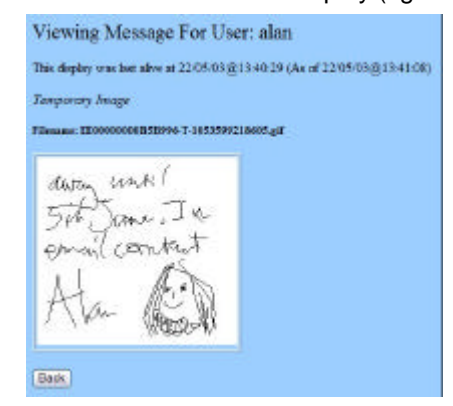
Figure 10: Viewing a user's Hermes display.

If a user's Hermes display has not communicated with the server for a period of time (and assumed to be 'dead') the entry is highlighted in red. Each row in the table provides a 'View' button to see what is currently displayed on the user's Hermes display (figure 10).