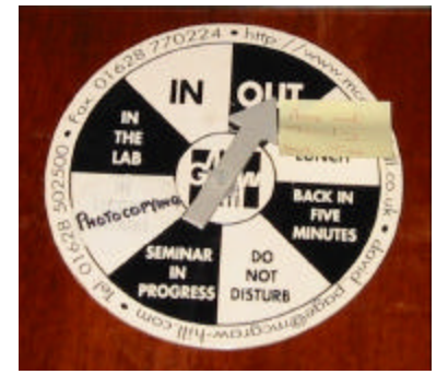
Figure 5: Typical message 'whirler'

We require users to integrate the Hermes system into their current patterns of use, for this to happen there will always be an initial cost-benefit trade off for users: It generally seems to take adaptation, consideration and time to integrate new technology into a daily routine. When designing Hermes the basic functionality we attempted to provide was that of paper Post-it® notes placed on office doors & message 'whirlers' as shown in figure 5.