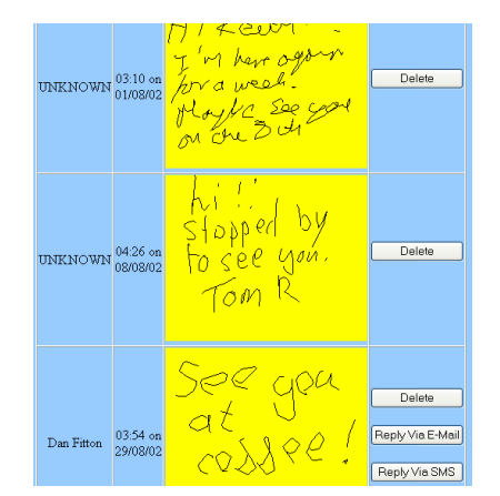
Figure 3: Viewing Messages via Hermes Web Portal.