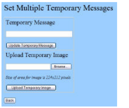
Figure 11: Set temporary messages for multiple users

When designing the Management Agent functionality was included allowing a Hermes administrator to change the temporary message for one or more users. When selecting the users to change the temporary message for, this feature is similar in use to pinging Hermes displays (selection using check boxes). When the administrator selects the 'Set Selected' button they are presented with the dialogue shown in figure 11.