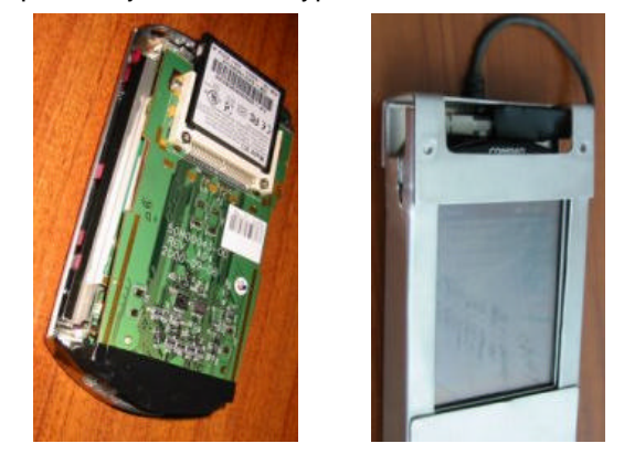
Figure 8: Modified Compaq iPAQ

We are currently developing a prototype display using a wired ethernet card which we hope will improve users' perceptions of reliability. This has proved challenging due to hardware constraints, the PDA in use, HP Jornada 568, only accepts type I compact flash cards, and type 1 ethernet cards have proved relatively scarce. For various reasons, including the need to utilize existing hardware, our current solution is to use a modified Compaq IPAQ and compact flash expansion jacket with a type 2 wired ethernet card.