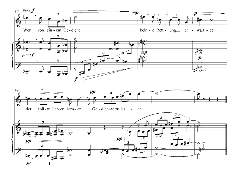
Example 1: Music © copyright by Hugh Wood; text reproduced by kind permission of Verlag Klaus Wagenbach GmbH, Berlin

Even when repetitions from one stanza to the next are taken into account, the shifting musical contexts within the second stanza signal a sensitive, as well as an extreme, musical response to the demands of the text. Comparison with the instrumental music discussed in the first part of this article reveals a somewhat expressionist rhetoric, in which each of the four two-bar units (the last extended by a further bar) contain contrasting textures, melodic contours, harmonic density (and dissonance) and, significantly, motivic content. Nevertheless, above and beyond that conferred by the text, there exists a sense of continuity within the passage. In particular, this can be felt in the (expanded) semitonal voice-leading prevalent in the outer voices of the accompaniment: these in turn relate to the frequent semitone leanings in the vocal line. The presence of characteristic melodic motion in the vocal line (the aforementioned semitones, as well as leaps of fourths/fifths) imparts a certain sense of coherence across the otherwise fractured musical surface.