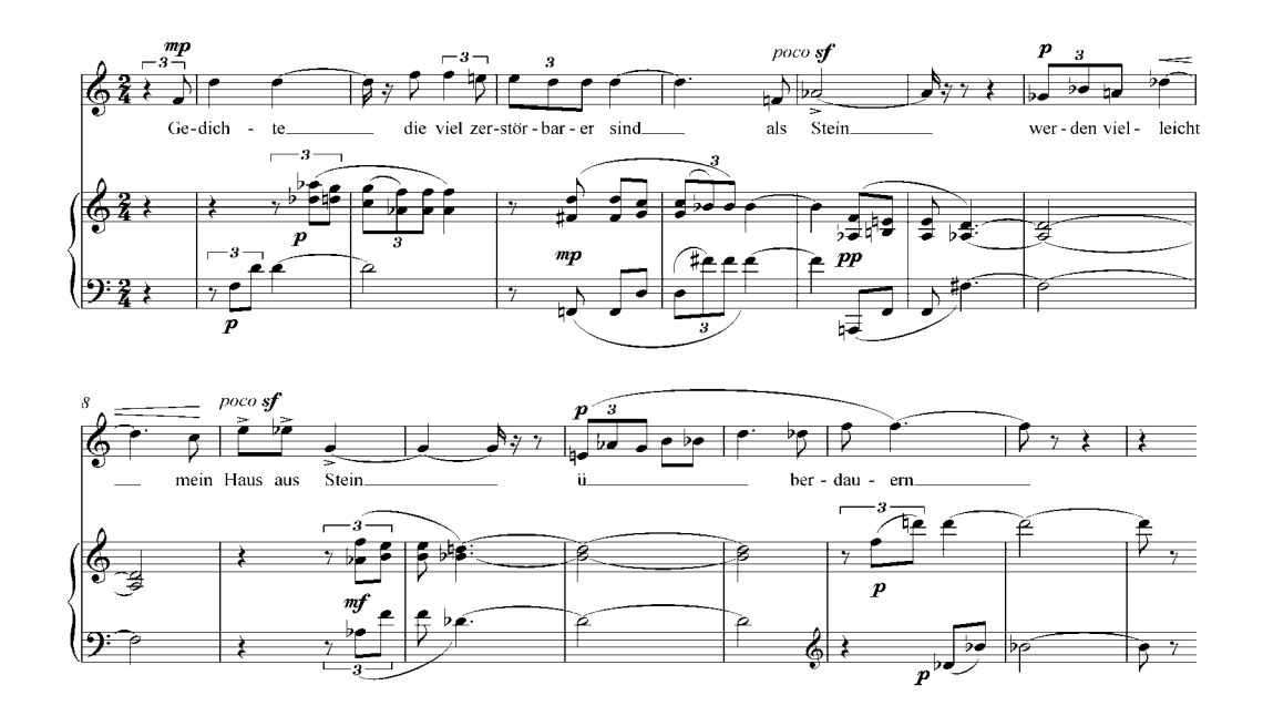
Example 2: Music © copyright by Hugh Wood; text reproduced by kind permission of Verlag Klaus Wagenbach GmbH, Rerlin