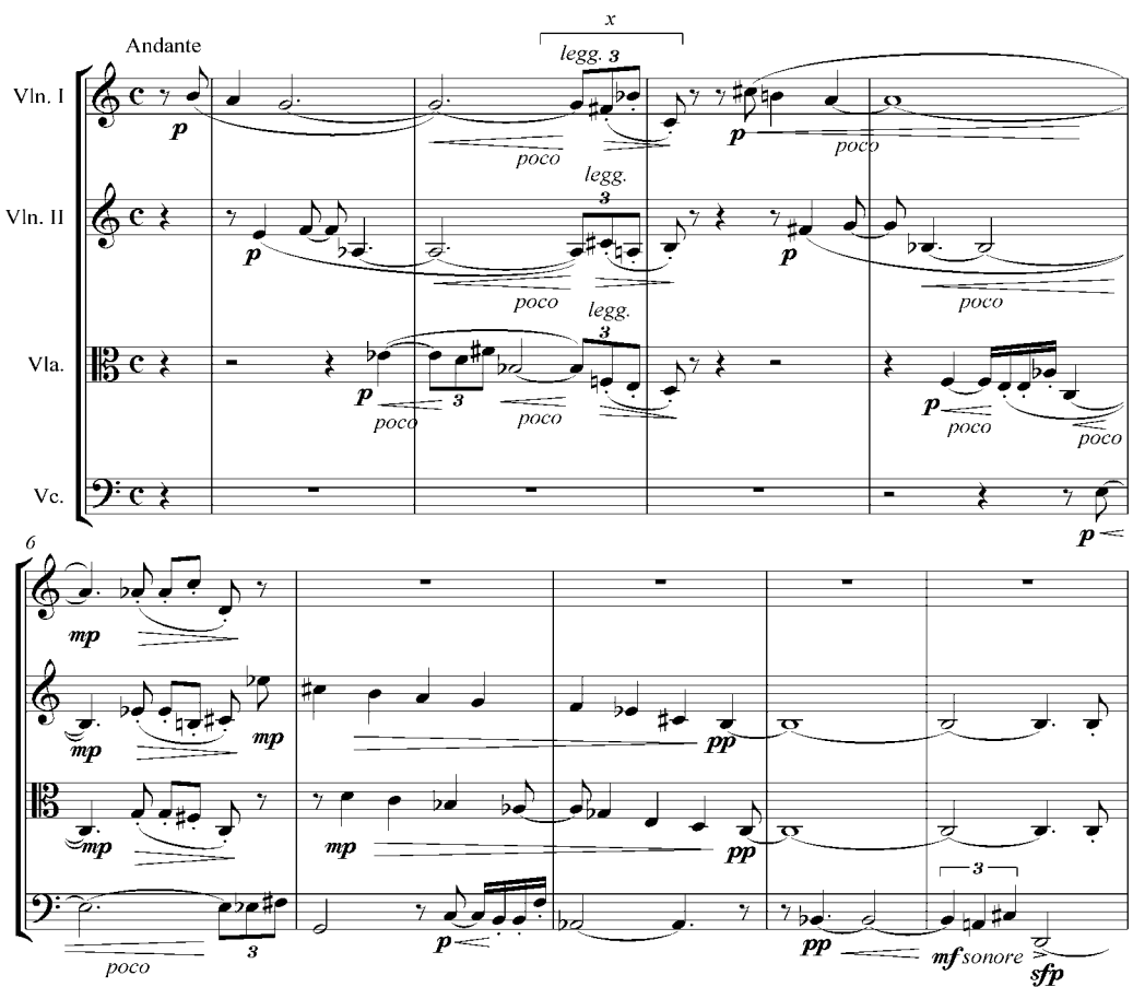
Example 4: © Copyright 2003 Chester Music Limited. All Rights Reserved. International Copyright Secured. Reprinted by permission

The material of the Romanza is as straightforward as its overall form. Nowhere is this more apparent than in the introductory sections to each stanza. The lyricism and delicacy of the opening of the movement (Example 4) is in no small part due to its faux-naiveté . The main materials are deceptively simple: the upper line largely based on descending whole-tone scales, and contrapuntal lower voices that abound with figures based on the contours of motif x. There is also a seemingly unsophisticated use of sequence: a direct transposition of material between the first and second phrases, and, to generate the pitch material of the third phrase, a second transposition of the whole-tone line. There are, of course, subtleties that reveal this to be a calculated artlessness, such as the rhythmic transformation of motifs and the placing and combination of material.