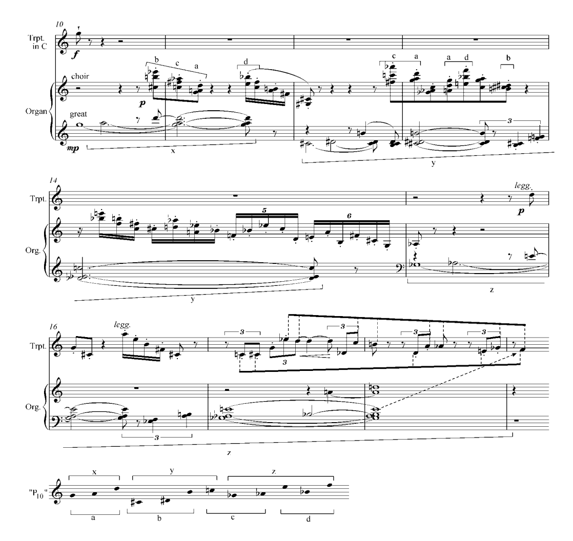
Example 3: © Copyright 2004 Chester Music Limited. All Rights Reserved. International Copyright Secured. Reprinted by permission

The chords in the right hand of the organ part are initially derived from a straightforward segmentation of the 'row', as can be seen in the Example. Nevertheless, it is the line in the upper voice of these chords that is taken and freely developed as a counter-melody. Indeed, the essence of Wood's musical argument is frequently – as here – the progressive (non-serial) elaboration of such cells and the generation of related material. Continually underpinning this free development, the slower-moving theme in the organ left hand functions almost in the manner of a cantus firmus. The final note of the theme is not given to the organ, but rather is reached via a compound melody in the trumpet that approaches it via contrary motion (see the beams added to the example). The F reached in the trumpet initiates a rhythmically contrasted 'second subject' based on the same pitch material as the original row. (The organ pedals provide a new 12-note countermelody.)