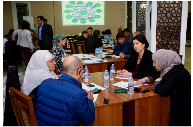
Fig. 4. Workshop in Bukhara.

In ‘Phase 3: Digital Inquiry’ (March–May 2020), we conducted eight online interviews, one online focus group and a survey (800 respondents, corresponding to 2.67% among 30,000 registered craft-makers) in order to map the impact of COVID-19 on the craft micro-enterprises. The survey was made available in Uzbek Cyrillic, Uzbek Latin Script and Russian. It included questions on the impact of the crisis, response to the crisis, digital and online activity, and support requirements. In total, 792 usable responses were obtained. The data files were cleaned once data collection was halted, and the merged file was analysed using SPSS. Open-ended answers on the age of the company, number of employees and region of operation were recorded for ease of analysis and presentation, splitting the results by a series of