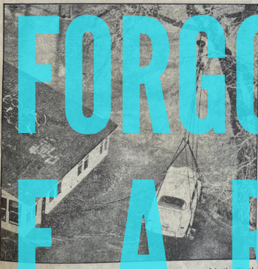
Here's what the town was swamped in the violent flood. Strong from a gale by black and white can be seen in the flood water. The children have their bicycles to use as rafts.

The whirlwind—it was described as a minor tornado—left a trail of havoc in which 100 houses were destroyed.