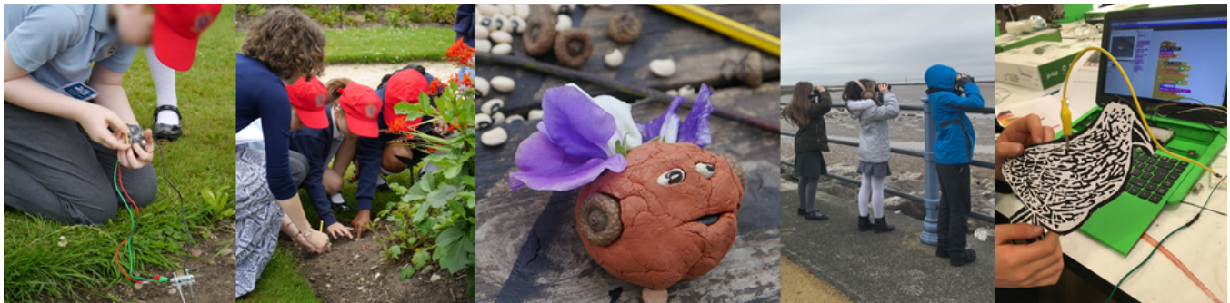
Figure 1: Digital Boggarts compilation: sensing soil humidity, sensory exploration of the garden, NFC-tagged Digital Boggart Photographs © Andy Darby. The Lost Sounds compilation: birdwatching, programming to make interactive bird prints.

Claire Dean c.dean3@lancaster.ac.uk Lancaster University, Lancaster UK