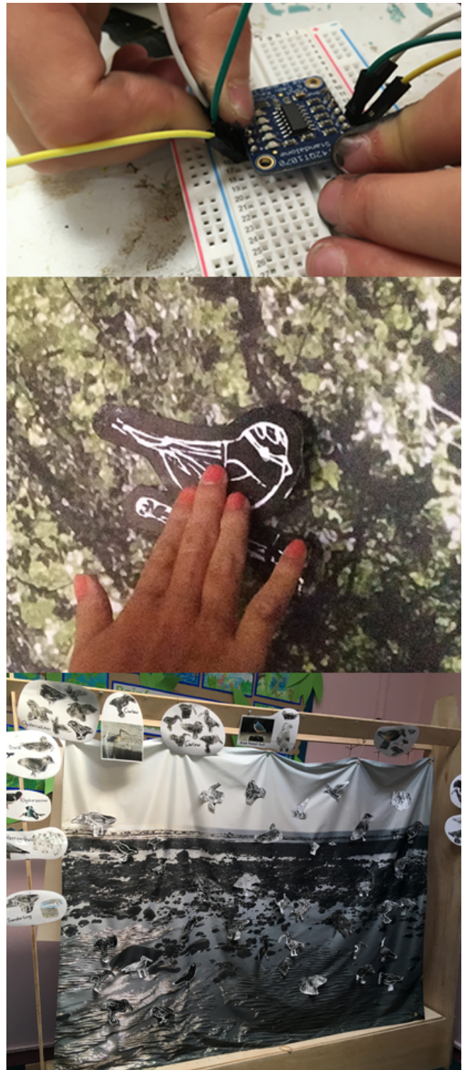
Figure 4: The Lost Sounds activities: wiring a capacitance sensor, close up of a conductive ink bird print, interactive display.