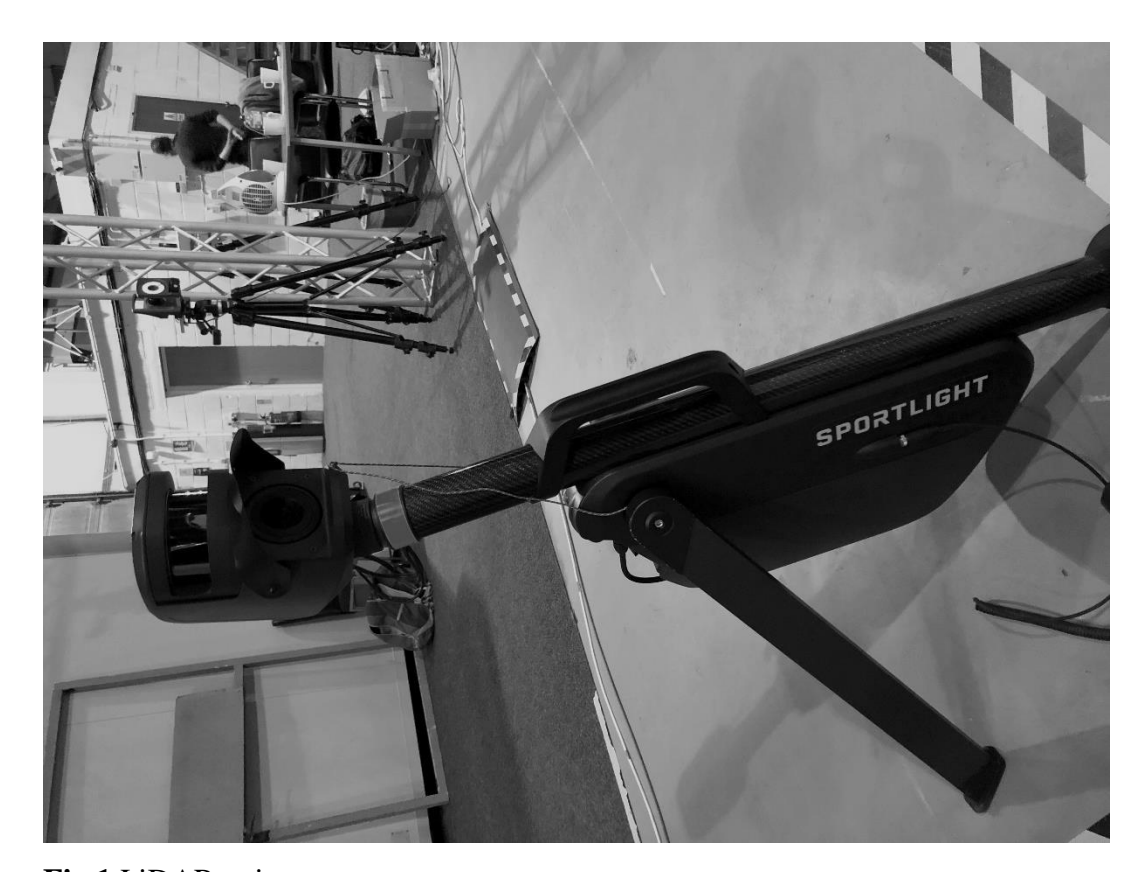
Fig 1 LiDAR unit