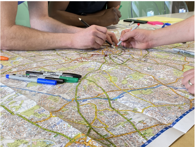
Fig. 2. Annotating maps was effective for sharing tacit knowledge about the city and the work

Building on our previous inquiries into workers' experiences in sustainable last mile logistics [13], the Switch-Gig project aimed to work with gig cycle couriers to identify key challenges in their experiences with the technologies and environments of work, and to propose alternatives. We hosted two co-design workshops in early March 2020, in Manchester, and York, UK, with 8 gig economy cycle couriers ("riders") who delivered food and groceries. Riders were recruited on the city streets as well as via snowballing through WhatsApp riders groups. Unions and local government were engaged to increase recruitment. These avenues were unsuccessful as the local government had no point of contact for riders (or gig workers in general) and the limited time frame of the pilot study was insufficient to build a relationships with worker unions. Riders were paid the living wage for their participation. These workshops took place shortly before the COVID-19 lockdown began in the UK, with several participants withdrawing before the workshops due to travel and exposure