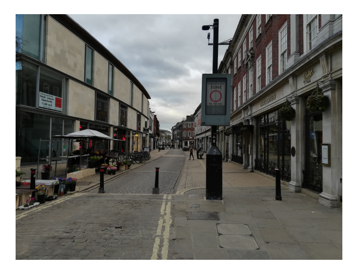
Fig. 3. York has complex time-restricted pedestrian zones, and being caught out is a \pm 50 fine.

ratings. Some riders have lists of restaurants from which they reject work because of how long they are made to wait. Poor ratings and complaints can lead to workers becoming deprioritised which impacts available shifts, and could lead to eventual dismissal. The constant need to please restaurant workers and customers creates additional stresses and is a form of emotional labour. Concerns around ratings leads to suspicion around every interaction and how it might affect their future work.