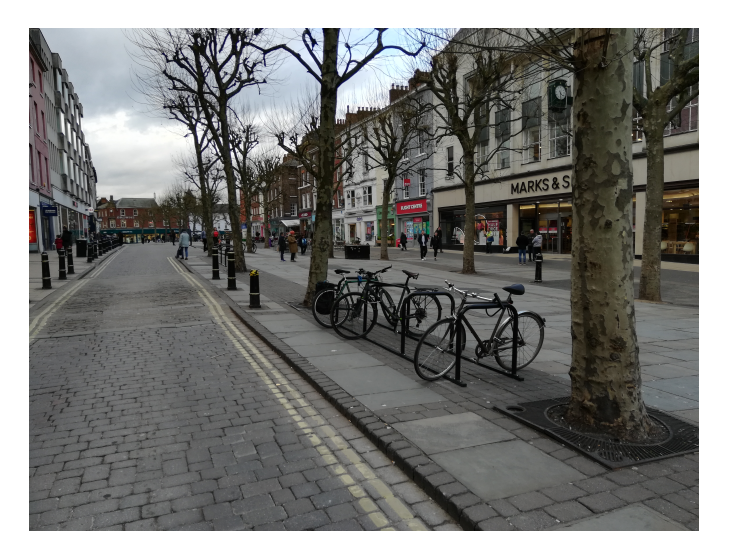
Fig. 4. Bicycle racks were removed for a Christmas Market and were not replaced till March.