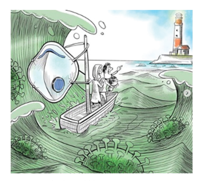
Figure 1. Sailing in a stormy coronavirus sea by Alireza Pakdel

coins the term hybrid pictorial metaphor for cases where a single visual entity combines elements of both a source and target concept, such as a boat's sail looking like a face mask in a cartoon we discuss in Figure 1 in section 3.1.1.