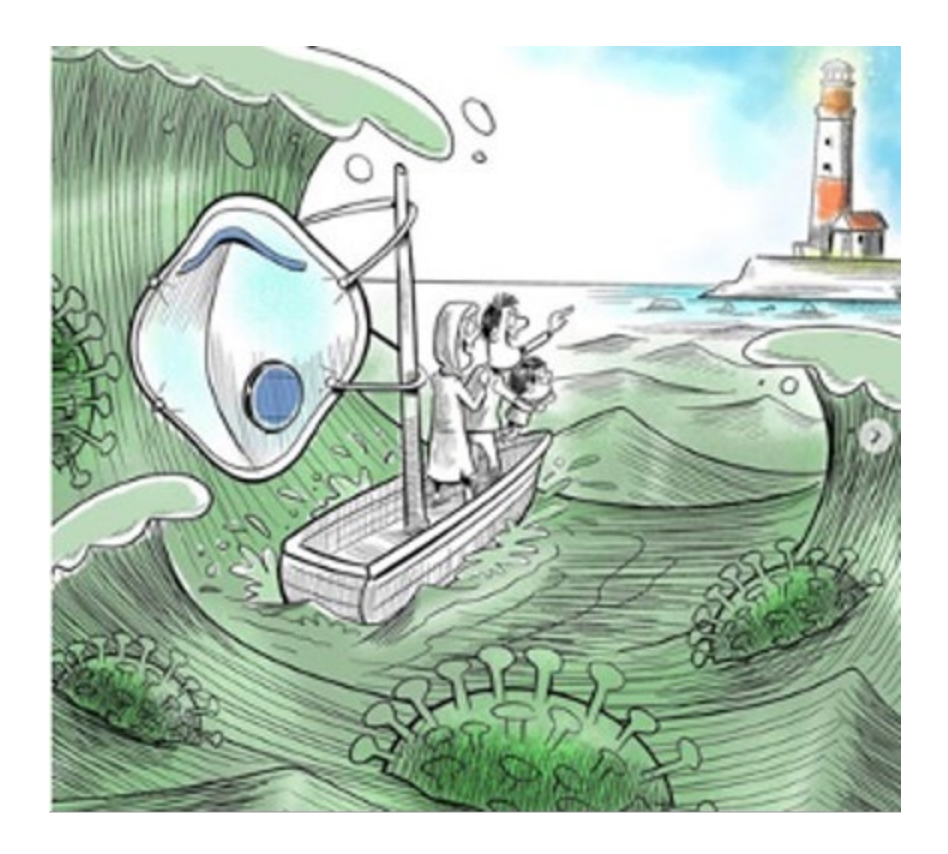
Figure 1. Sailing in a stormy coronavirus sea, by Alireza Pakdel https://www.instagram.com/p/B9OsjmunEaw/; 2/3/2020 added by Zoe Gravani)