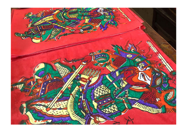
Fig. 6 Door God Woodblock prints.

To enhance cultural self-confidence through ICH activities, China has implemented two strategies – 'creative transformation' and 'innovative development' –