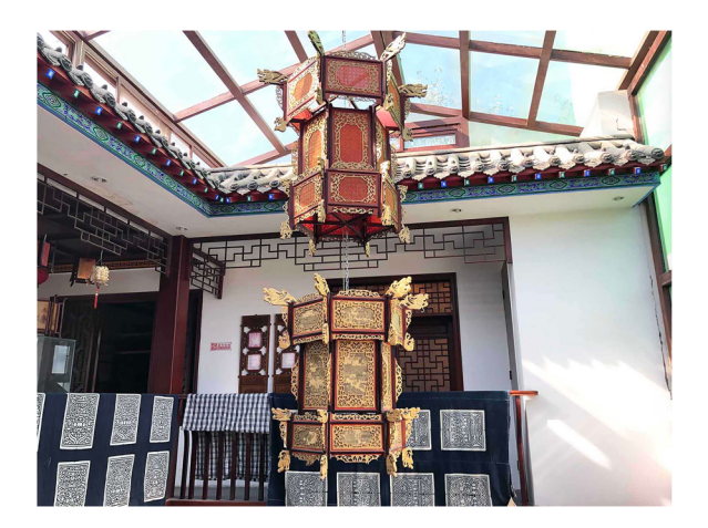
Fig. 1 Traditional lanterns are exhibited in a museum which was refurbished from inheritor Juntao Zhang's ancestral house, Kaifeng, China (authors' photo, 2019)

A sense of responsibility to continue the tradition When inheritors were asked about their motivations for continuing these practices, the concept of responsibility was frequently mentioned – a strong sense of responsibility to continue the tradition. This was especially the case when they had been designated as an ICH Inheritor at the national, provincial and/or municipal level. A10 described a significant change when their family's ceremonial lantern making business was included in the list of China's national ICH: