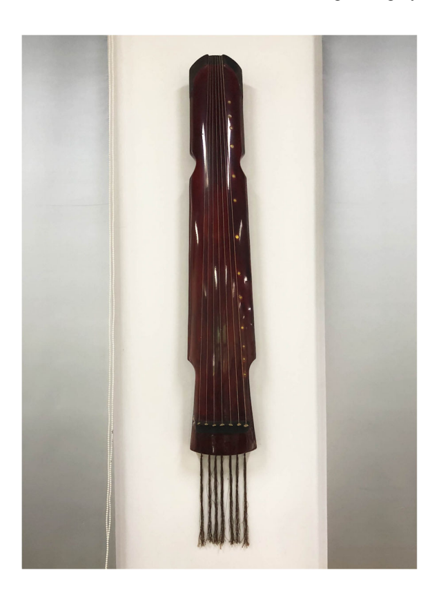
Fig. 2 The Guqin musical instrument (authors' photo, 2019)

In the case of New Year woodblock prints, the prints themselves are relatively inexpensive. However, the craft skill, in the form of woodblock carving, is highly