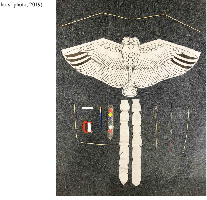
Fig. 7 Kite kits used for teaching

bamboo sticks into lightweight careful profiled rods has been replaced by mass-produced bamboo sticks of uniform profile. Silk and paper for traditional kites have been replaced by waterproof plastic sheet, which is more robust and prevents the kites being damaged when taken out in the rain. In last 2 years, she has taught about 15,000 students this simplified version of traditional kite making (Fig. 8). Similarly, other inheritors we interviewed also spend time teaching for non-commercial reasons. Specifically, in the cases of A3 and A7,