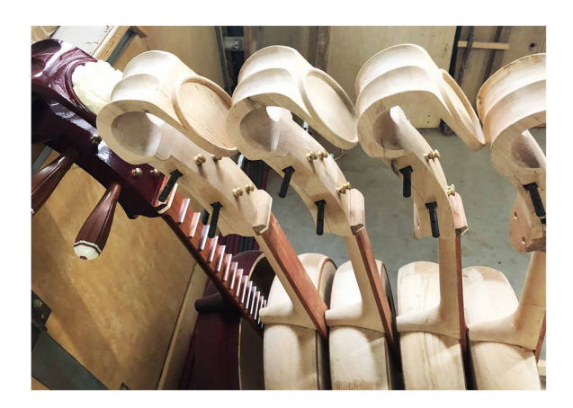
Fig. 5 Ruan musical instruments co-made by several craftspeople (authors' photo, 2019)

Production The craft practices we studied usually had a small-scale of production (less than 10 people). Four of our interviewees were sole makers, (A1, A2, A3 and A10). A1 and A2 chooses specific customised orders for producing kites, such as orders for the old-style kites that appear in Chinese historical dramas or movies, and also miniature kites that are framed by collectors as art pieces. In the case of A7, A8 and A11, a family-based production model is adopted. A11 works with his father to make iron farm tools and knives in busy periods. His mother and his wife