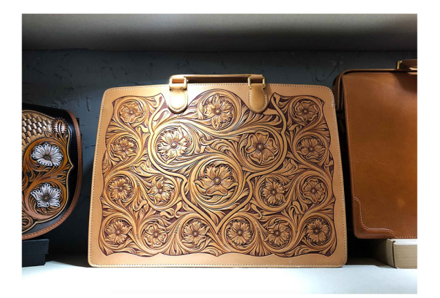
Fig. 4 Leather hand bag with intricate carving (authors' photo, 2019)

strength and acoustic properties. Following selection, there is a long period dedicated to wood treatment. For example, in the case of A5, high quality Tung wood (a deciduous tree often grown for its oil) is an important material in the making of the Ruan, however, before it can be used in instrument making it has to be dried over a long period.