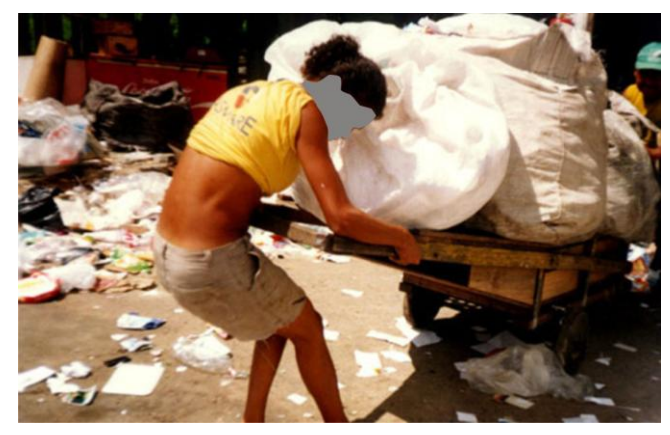
Figure 1. Scavenger and one model of wood cart used by scavengers in Belo Horizonte.

used by scavengers, and to help them learn new skills (Figure 1).