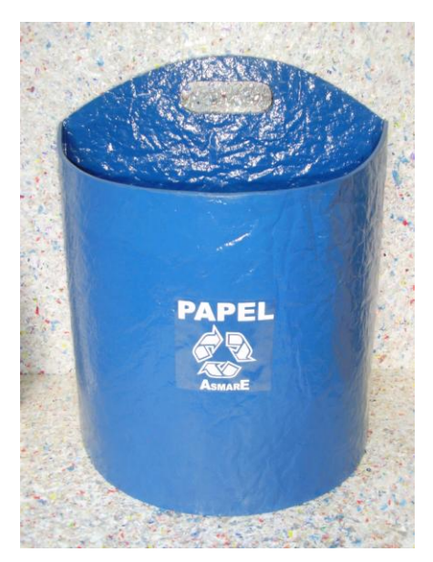
Figure 2. Dustbin manufactured in the carpentry factory.

One of the particular aspects of the carpentry products in the furniture sector is the constant quest to do what is (categorized by actors involved in the work) as "ecoproduct", which in this case means making products made up of recycled (such as ecoplaca) or reused material according to customer demand and the nature of activities in AMARE. In many cases the customers already knew the ASMARE or acknowledged the work carried out there with the collect and sorting of materials, some of which cooperate in other ways as with donation of recyclable materials.