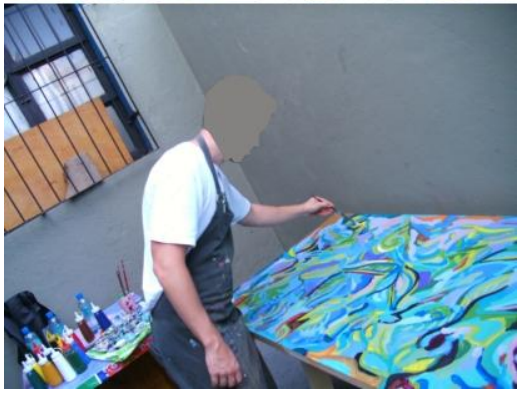
Figure 5. Some stages of production process from one reuse experience.

The design process in the employment of reuse materials available involves a creative effort to