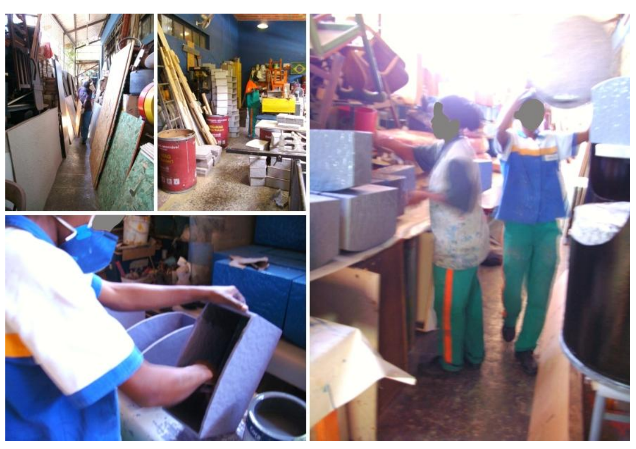
Figure 4. Some stages of dustbins' production process.

The serial production (in the case of dustbin) can