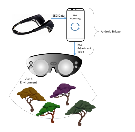
Figure 2: The system architecture for the neurofeedback prototype. Data is provided by the Muse headset and then relayed via an android bridge to the Magic Leap HMD. Within the Unity application, the tree's texture color is directly adjusted based on the relative alpha band value.