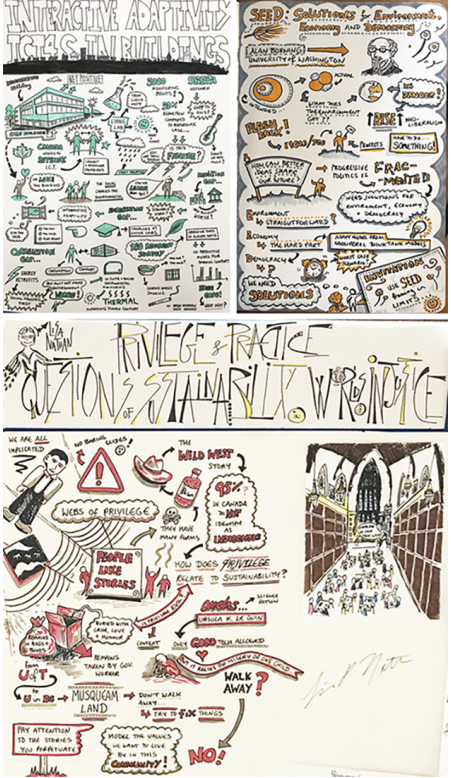
Figure 5: Keynote example sketchnotes and headers

Dissemination: The publication of visual proceedings at an appropriate venue is being investigated following the event. During the conference, some attendees posted their imagery online via social media, and the conference chairs updated the main conference website with some images. The facilitators encouraged the use of social media to showcase work. We also kept in contact with participant group after the event in order to ensure appropriate attribution (as above) and further engagement.