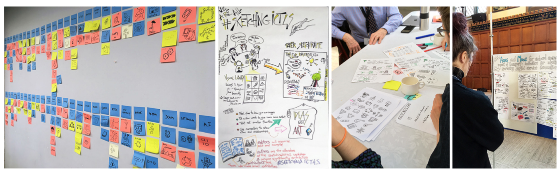
Figure 3: Left: Visual icon library in progress -- concept sketches are posted below the theme; Middle Left: Collaboratively produced instructions for conference attendees displayed at the registration desk; Middle Right: Participant sketching and icon stickers; Right: An attendee surveys some of the generated sketches

contribute to on-line visualizations, then it may also be possible to gather visual data in realtime using [off-line] methods.