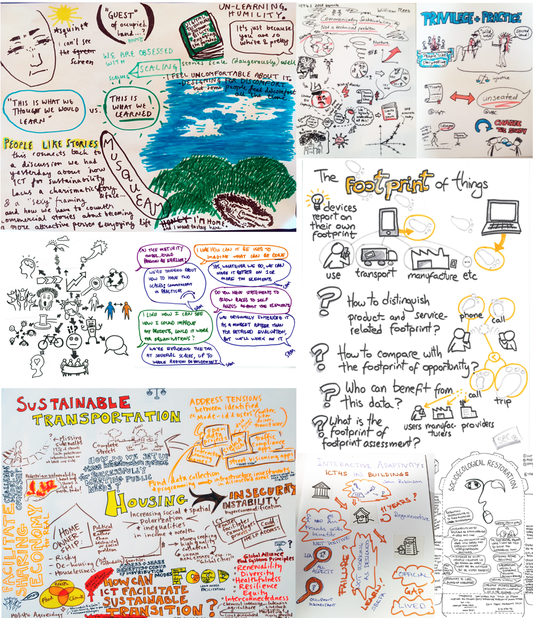
Figure 6: Examples of attendee sketching and use of visual icon library for session talks and panels

Non-Public Participatory Engagement: A final item of note was that some attendees actively engaged in the sketching activity, but instead preferred to draw in their own notebooks, or created images on the materials provided, but took them away after each sessions. When asked, one participant said that they liked the idea but also wanted to be able to refer back to the images to aid memory, or for future research. Others were shy about sharing, and enjoyed the activity but did not want to be judged on ``bad drawings", regardless of the encouragement given. No record was taken of these private images, so we cannot analyse them for content.