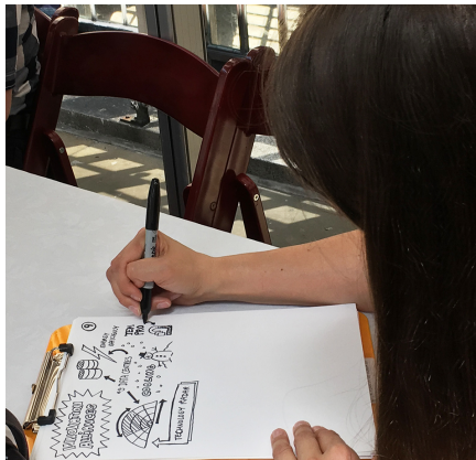
Figure 1: A participant sketches a converstation

Keywords: sketchnotes; graphic recording; visual facilitation; attendee-sourcing; sustainability;