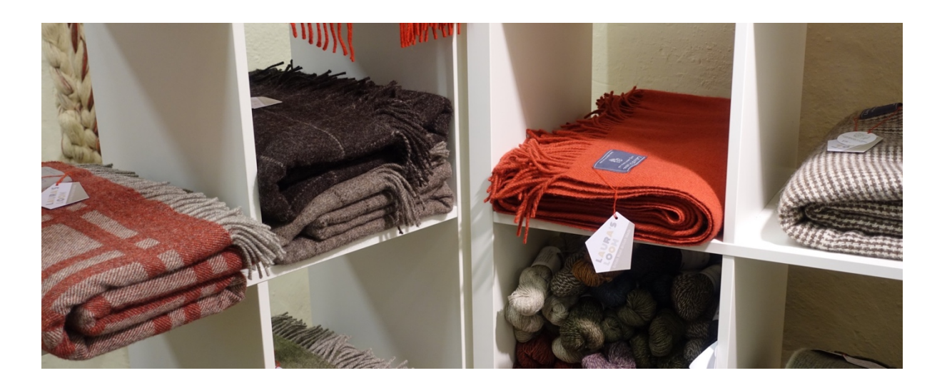
Figure 3: Woven products by Laura's Loom

moving to the small market town of Sedbergh, to the east of the county. She produces a range of hand woven and commercially woven products, including scarves, throws, socks and blankets. Her products are made from a mix of Blue Faced Leicester and Swaledale fleeces.