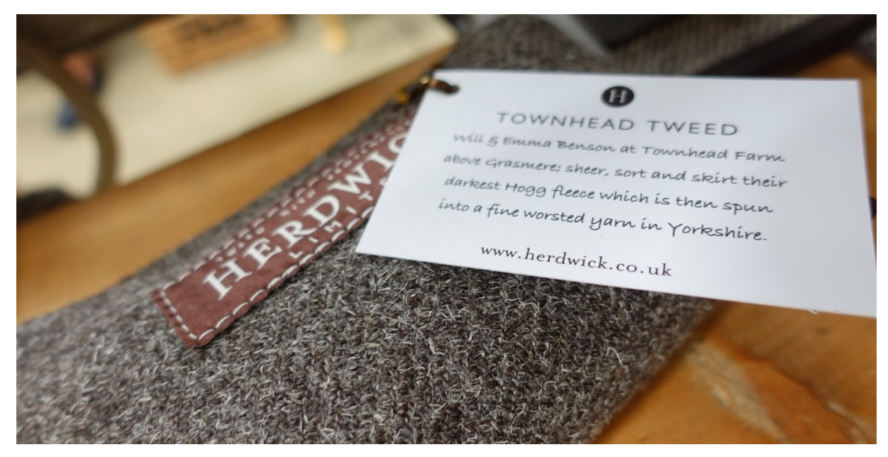
Figure 4: Townhead Tweed by Herdwick Limited

Located in Near Sawrey, a small village in south Cumbria, Herdwick Limited produces bags and accessories made from tweed. Based in Castle Cottage, the former home of Beatrix Potter, the sole proprietor Mandy lives as the custodian for the National Trust. Mandy purchased some Herdwick tweed fabric to re-upholster a window seat in the cottage, but ran out and set out on a journey to make her own fabric which she would use for bags and accessories.