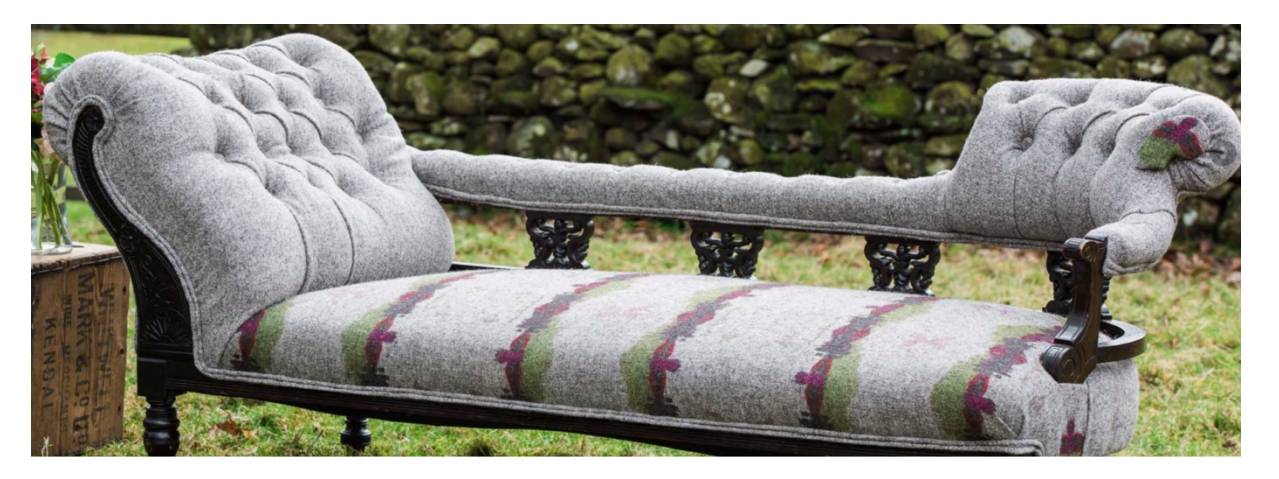
Figure 2: Re-upholstered chaise longue by Cable and Blake (image © Cable and Blake)

This company, run by two friends, is located in Kendal, a small market town in the southern part of the county of Cumbria. The town has a rich history associated with the wool trade and has the motto "Wool is my bread". The owners of Cable and Blake work part-time in the enterprise from their small shop on the town's main street. Their fabric is designed in-house using the local landscape as inspiration for colour palettes and abstract patterns.