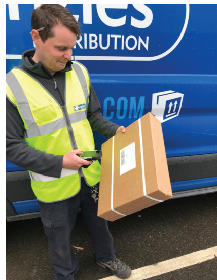
Single scanner used for all carriers