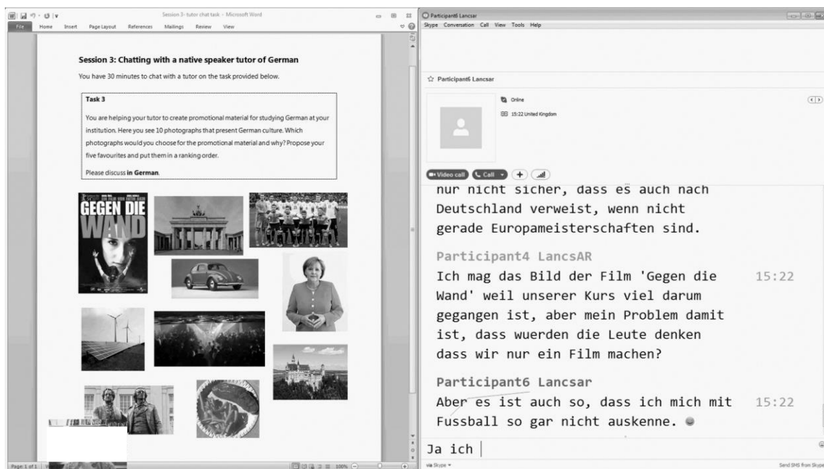
Figure 1. Set-up on the screen with task instruction (left) and Skype chat window (right).

Participants were given one minute to read the instructions, after which they contacted their chat partner and started the 30 minute conversation.