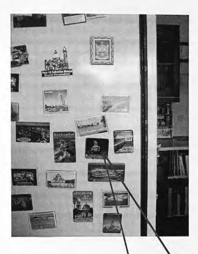
Plate 8.1: Personalised magnet of Arthur's grandson on his kitchen fridge, displayed with magnets depicting holiday destinations. Image taken by author and permission obtained from the boy's parents ©