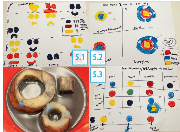
Figure 5. P5's stamps and visualizations. Visualizations 5.1 and 5.3 are matrices, while visualization 5.2 falls under the Other category.

10.2 uses spilled paint stains on a sheet of paper to represent money spent over different days.