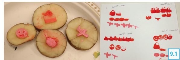
Figure 3. P9’s stamps and visualizations show an example of multiple patterns from multiple stamps.

While most stamp patterns were composed from a single shape, participants P1 and P5 composed modular stamp patterns by combining several smaller stamps. P1 composed several axes stamps together to create annotations for their visualization (1.1), as shown in Fig. 2, while P5 composed Chernoff faces [7] (5.1) and stacked circles (5.2).