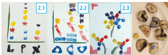
Figure 4. P2's stamps and visualizations. Visualizations 2.1 and 2.2 are dot plots, while visualization 2.3 is stamped in a way to look like flowers.

Dot/Scatter Plots and Matrices (8/21): We classify visualizations as dot/scatter plots and matrices if they encode data values (e.g., enjoyment, cost) along visible categorical and numerical axes. While dot/scatter plots and matrices are defined as the second-most numeric representations along the original continuum, this is not necessarily the case with our visualizations. Visualizations 2.1 and 2.2, shown in Fig. 4, are represented as dot-plots; however, the data is highly abstracted and it is difficult to extract the raw values. Visualization 5.1 and 5.3, shown in Fig. 5, are matrices defining enjoyability over different days and locations, but numerical data ( Cost ) is either not encoded (as is the case with 5.3), or has been transformed into binned categories (as is the case with 5.1).