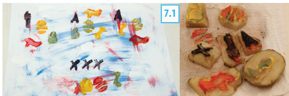
Figure 6. P7’s stamps and visualization show an example of a visualization without annotations.

Annotating Guides. In 7/10 cases, participants laid down partial annotations prior to stamping on their paper, or while continuing to make stamp marks. In 6/21 visualizations, participants created axes or data grouping headers before stamping onto the page, presumably as guidelines for where to stamp.