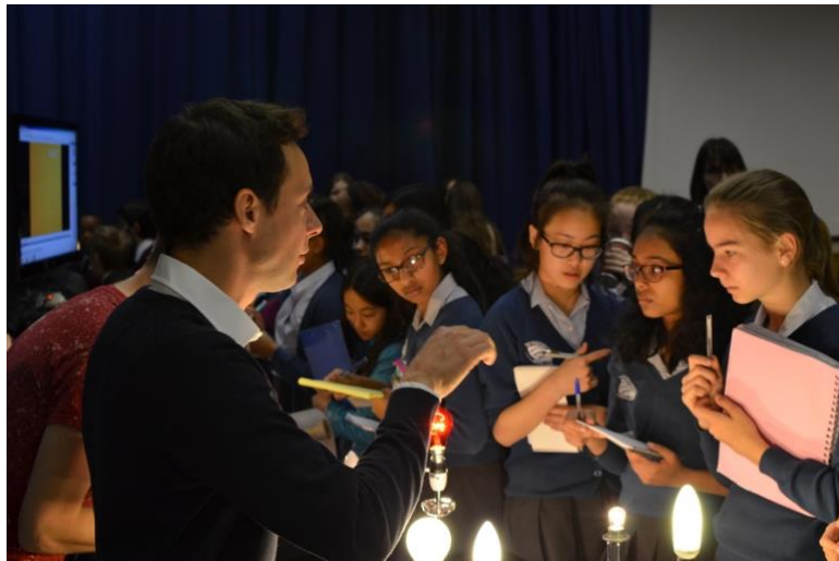
(c) Schoolchildren learning about light. (Will Dunn)