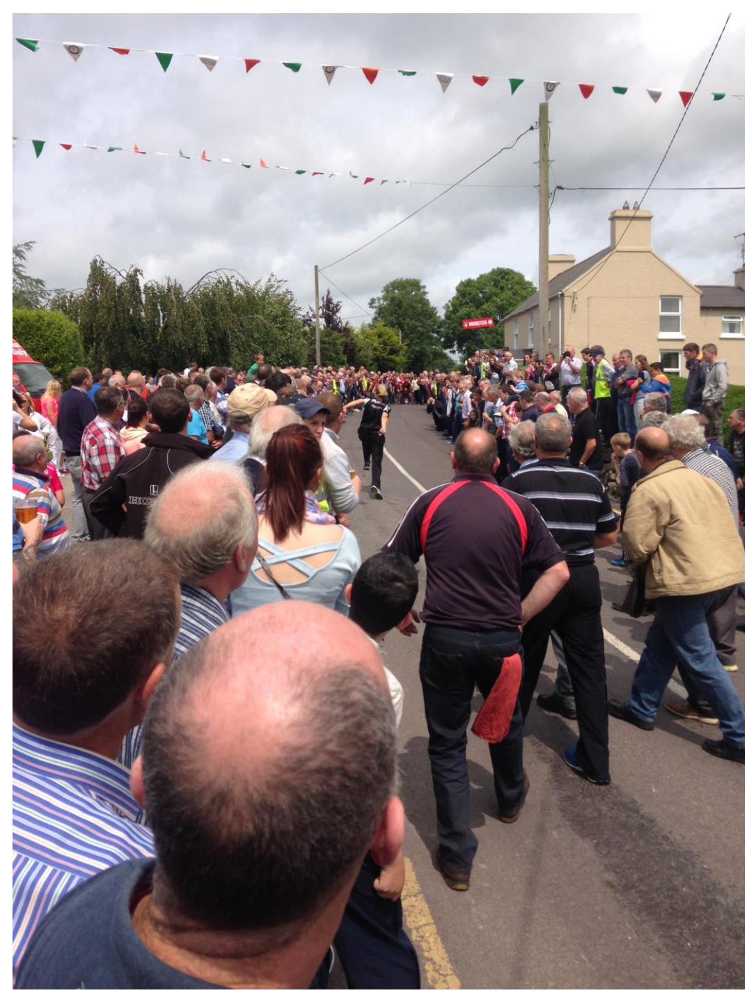
Figure 1: Road bowling, Lyre, County Cork, Ireland July 12<sup>th</sup> 2015