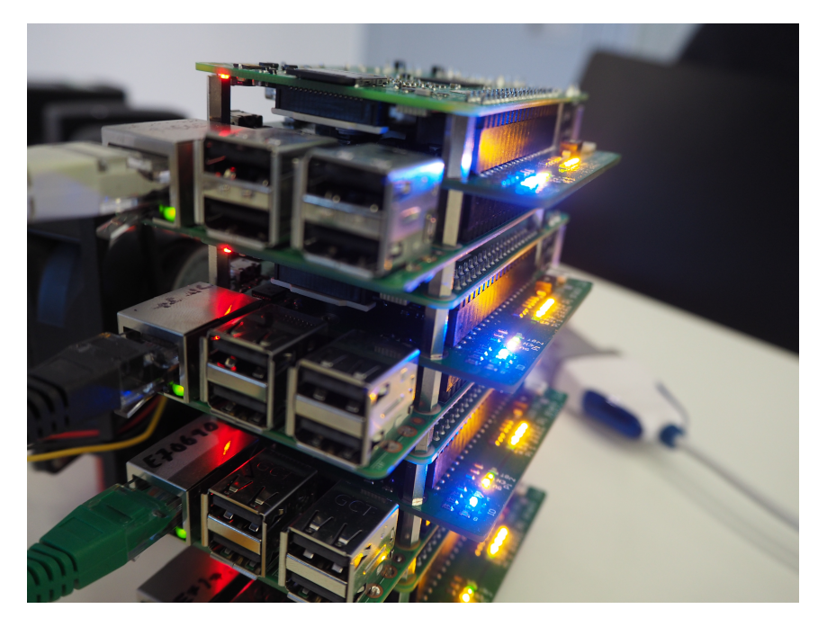
Figure 2: A micro data centre comprising a cluster of Raspberry Pis that was assembled at the University of Glasgow, UK. These data centres in contrast to large Cloud data centres are low cost and low power consuming.

data centres with millions of cores,' is now moving towards 'millions of data centres with dozens of cores.' These micro data centres are novelty architectures and miniatures of commercial cloud infrastructure (see Figure 2). Such deployments have become possible by networking several single board computers, such as the popular Raspberry Pi [9]. Consequently, the overall capital cost, physical footprint and power consumption is only a small fraction when compared to the commercial macro data centres [10].