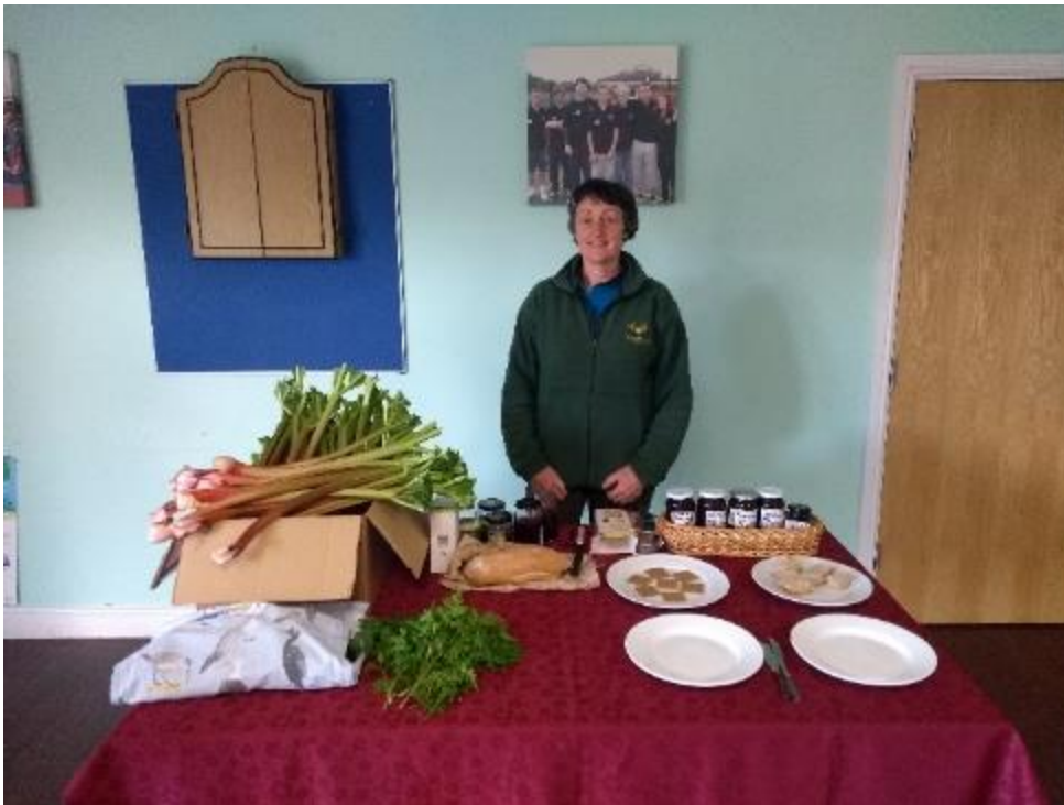
Image 7: A Food Tasting Session around Rhubarb, organised by one of the local farmers supplier of food hubs in Preston (Fieldwork Photograph, May 2018)

In these sessions potential customers have the opportunity to try raw or cooked produce.