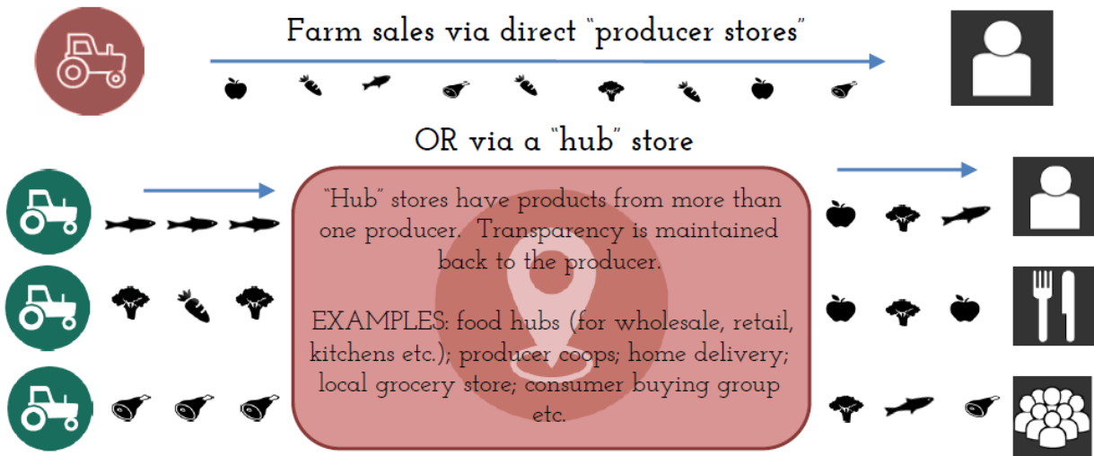
Image 1: Off-line and On-line Food Hub Models