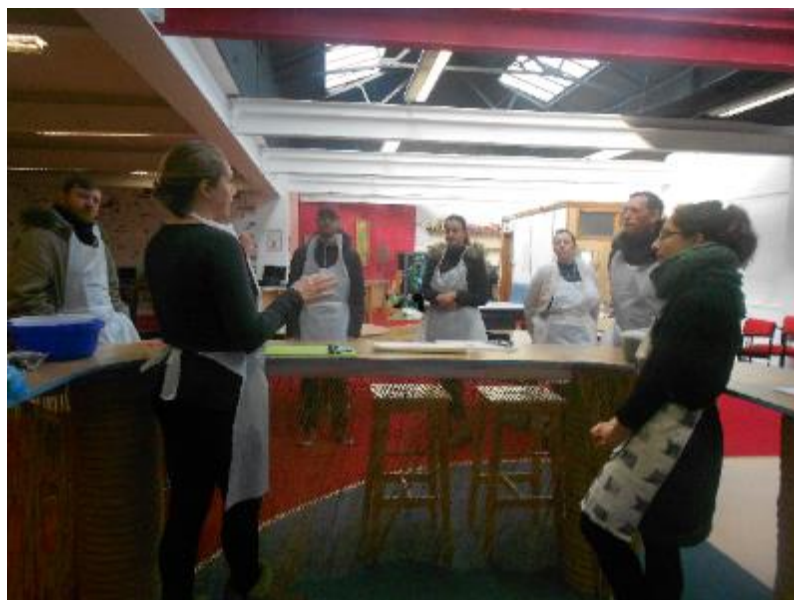
Image 4: Trialling a cooking session at Community Centre, Preston (Fieldwork Photograph, May 2017)

This requires that the premises hosting the OFN hub have facilities, e.g. space, equipment, that would allow these classes to take place. These cooking sessions are envisaged as also offering socialisation and community-enhancing benefits to their participants. In one of our research sites, an organisation participating in the promotion of OFN Food Hubs in relatively deprived city areas, trained a number of volunteers, the 'Food Champions', in issues of food preparation, cooking, storage, nutrition and hygiene. 'Food Champions' who worked in community organisations proceeded then to organise and lead cooking sessions of the kind described here in which cooking 'hacks', skills and nutritional knowledge was shared among participants.