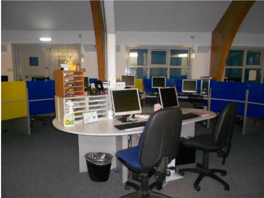
Image 3: Facilities and IT support are available at Meadow Well Community Centre to local food hub users (Fieldwork Photograph, January 2018).