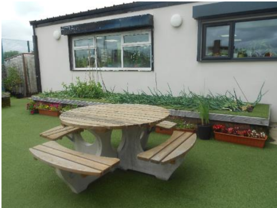
Image 11: Local Food Garden at a Food Hub Point, Intact Community Centre Preston (Fieldwork Photograph, July 2017)

Small-scale, local growing projects typically may not produce volumes big enough to supply a Hub; the range of produce grown may be limited; locally grown vegetables may not match the glossy, uniform appearance of supermarket-sold produce and therefore may appear unfamiliar and undesirable to consumers; and, finally, there is the issue of seasonality: consumers may not be used to only being able to get certain products at certain times of the year. If you are already growing your own food, you may already be using it for other purposes (e.g. cafes) which puts a constraint as to how much can be used for the purposes of the OFN food hubs.