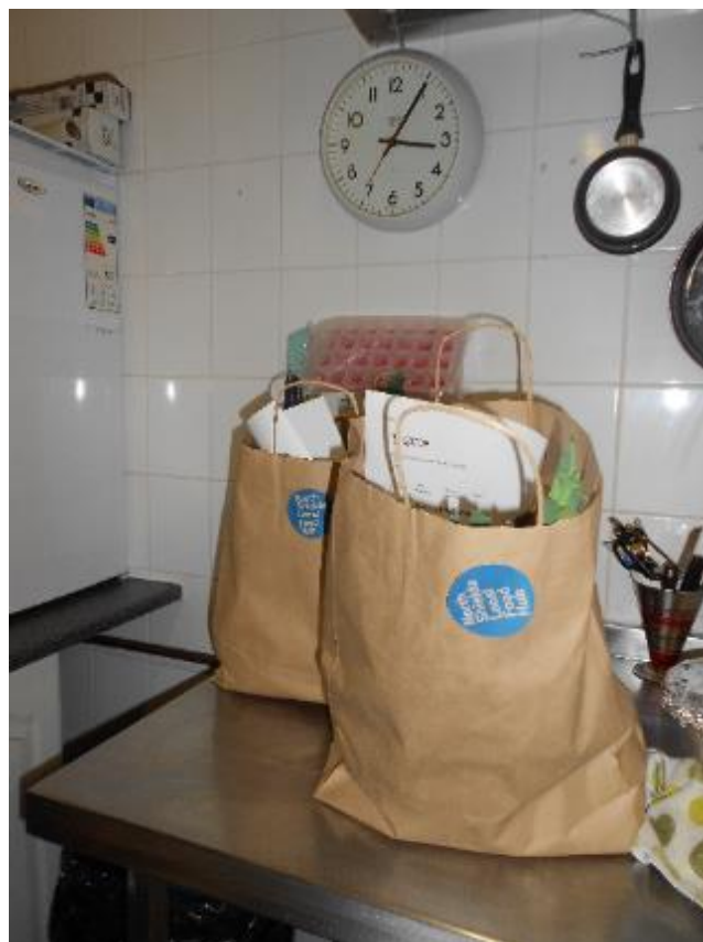
Image 9: Meal box from North Shields Hub, Newcastle (Fieldwork photograph, January 2018).