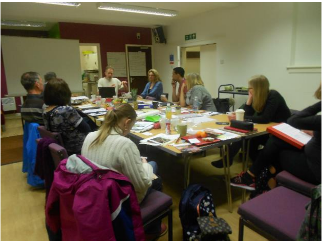
Image 2: Preston meeting of prospective food hub co-ordinators with OFN representative (Fieldwork Photograph, 10 January 2017).

In 2017, OFN Local Food Hubs were piloted in relatively deprived areas of two UK cities, Preston and Newcastle, in collaboration with the Larder and the MeadowWell Community Centre. This was in order to understand and assess how OFN Local Food Hubs could help mitigate and alleviate food poverty in these areas. Though there were unique challenges in the development of both Hubs, it was found that Local Food Hubs can fulfil a unique place in the food provision landscape, being both a for-profit enterprise and a focus point for community.