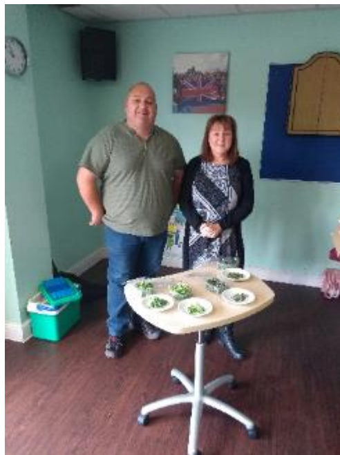
Image 6: 'Meet the farmers' event at the Intact Community Centre Food Hub point (Fieldwork Photograph, May 2018)

In these events suppliers/producers will have the opportunity to speak about their produce and the reasons it differs from produce as usually found in supermarkets.