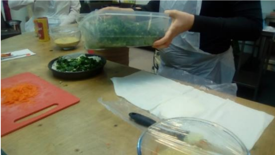
Image 10: Food cooked at a trial cooking session (Fieldwork Photograph, May 2017)

Like the ones offered by the social enterprise 'Our Kitchen on the Isle of Thanet' which tackles deprivation in a low income area of Kent by providing low cost ready meals and meal packs.