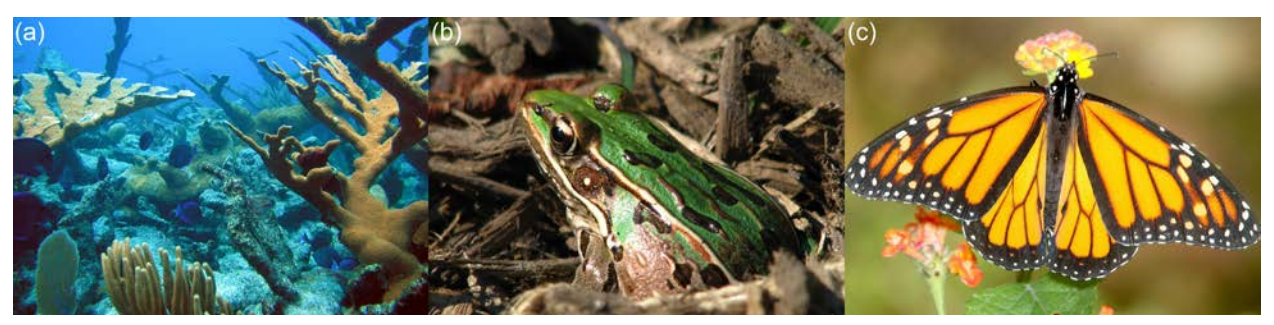
Figure 2. Citizen science data are collected on diverse organisms, including (a) coral reefs, such as this one in the US Virgin Islands, (b) amphibians, such as this southern leopard frog ( Rana sphenocephala), and (c) insects, such as this monarch butterfly ( Danaus plexippus).