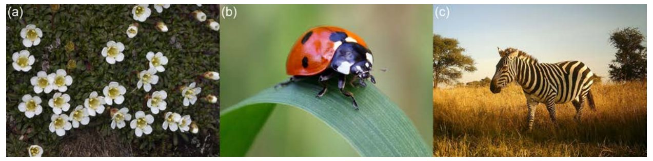
Figure 4. Citizen science data are collected on diverse organisms, including (a) flowering plants, such as this pincushion plant ( Diapensia lapponica), (b) insects, such as this Coccinellid, and (c) mammals, such as this plains zebra ( Equus quagga).

Figure 3. Citizen science data are collected on diverse organisms, including (a) trees, such as this red maple ( Acer rubrum), (b) crustaceans, such as this shore crab ( Carcinus maenas), and (c) birds, such as this American yellow warbler ( Setophaga petechia).