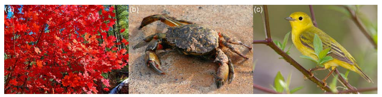
Figure 3. Citizen science data are collected on diverse organisms, including (a) trees, such as this red maple ( Acer rubrum , image by Al_HikesAZ/Flickr/CC BY-NC), (b) crustaceans, such as this shore crab ( Carcinus maenas , image by John Haslam/Flickr/CC BY), and (c) birds, such as this American yellow warbler ( Setophaga petechia , image by Laura Gooch /Flickr/CC BY-NC-SA).

Figure 2. Citizen science data are collected on diverse organisms, including (a) coral reefs, such as this one in the US Virgin Islands (image by NOAA's NOS/Flickr/public domain), (b) amphibians, such as this southern leopard frog ( Rana sphenocephala , image by Joe McKenna/Flickr/CC BY-NC), and (c) insects, such as this monarch butterfly ( Danaus plexippus , image by Alan Schmierer/Flickr/public domain).