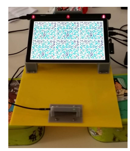
Figure 1: Data collection apparatus in a public space.

Centred on computing, decision-making studies either evaluate ways to assess or avoid indecisiveness, or explain what triggers it. For instance, detecting frustration is presented in [Alabdulkarim 2014] using sensors to detect typical hand features. Gonzalez [1996] investigated the role of animation in user interfaces in decisionmaking. The impact of the stimuli and potential distractors on the hand movement are analysed in [Chapman et al. 2010; Song and Nakayama 2009]. Our work spans through both worlds as we describe the gaze and hand behaviour that characterises decisionmaking.