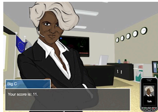
Fig. 3. Score Computed based on the Weight attached to Player's Answers in the Game

Seamless Evaluation [17] has been defined as an evaluation embedded through the educational content in such a way that is not intrusive to the user. The extension presented here would allow the authors to create a summative assessment, by