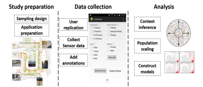
Figure 1. Overview of crowd replication process

Motion Sensing : Our motion sensing operates on three dimensional acceleration and angular velocity measurements. From acceleration