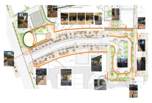
Figure 3. Target public space and its nine entry points.

Here d_i is the indicator drawn from trajectory i and l_i is the length of i-th trajectory, and l is the mean length of the trajectories.