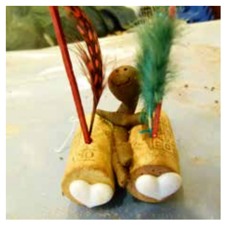
Fig 9: Richard's model of a raft

Children expressed an understanding that what counts as normal has in fact changed. They recognise that there is a 'new normal' which includes flooding and taking measures to prepare for and adapt to flood events.