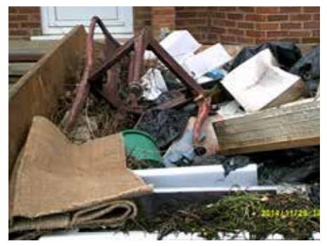
Fig 5: The skip, one of many photos taken in Staines-upon-Thames by the young people during a walk around the local flood-affected area

... shows the destruction the floods left.... It shows all people's memories and all their, like, precious things that got ruined.