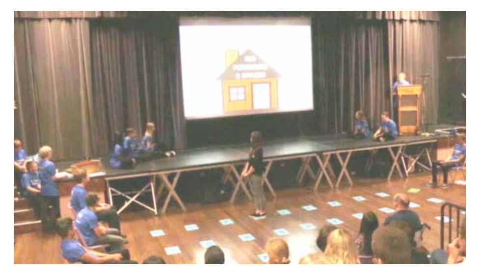
Fig 10: The 'flood snakes and ladders' stakeholder event

At the end of the performance, audience members were given the Flood Manifestos and invited to respond by writing a pledge about what action they would take based on what they had seen (see Appendices 3 & 4).