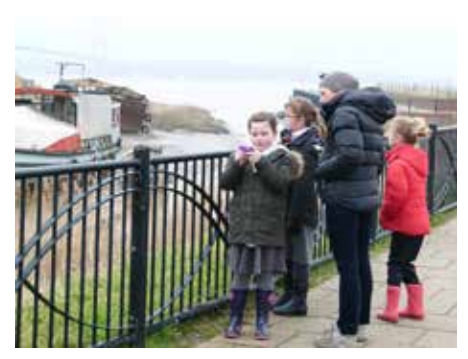
Fig 2: Walking and photographing the local landscape