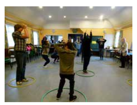
Fig 1: Warm-up game

In this way, data collected during workshops and the stakeholder events included: photographs; video and audio recordings of walking, discussions and phototalk sessions; group discussions during sandplay, 3D modelling and theatre activities and interview transcripts. Audio recordings were transcribed. This multi-media material was coded and categorised thematically in research team meetings and organised using Atlas.ti software. Key themes were taken back to the children for discussion and to support the development of their stakeholder presentations and Flood Manifestos.