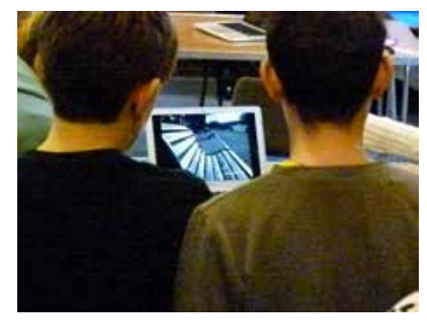
Fig 3: Phototalk session