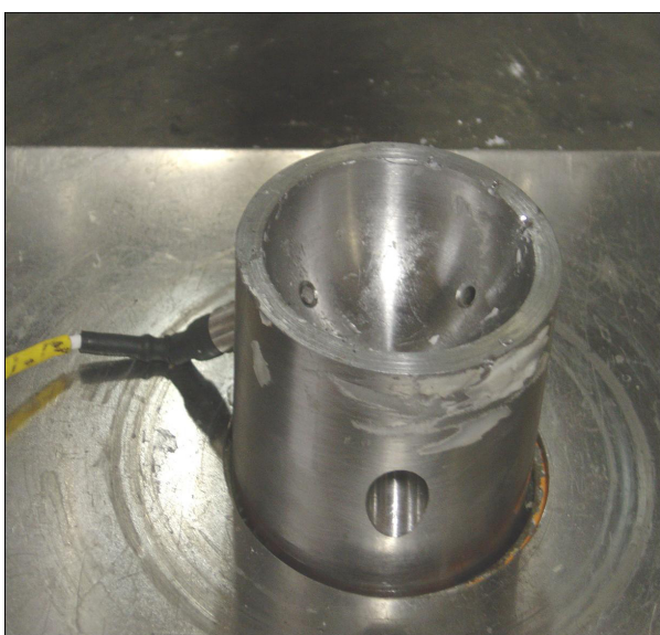
Figure 1 Metal acetabulum with a transducer.

3 different cup types were compared, with similar outer diameters of around 48 mm to ensure a uniform cement mantle of at least 2 mm all around. These were, the Charnley Ogee flanged cup (size 47 mm with an outer diameter of 47 mm selected as 48 mm cup is not produced by the manufacturers), the Exeter low profile cup (size 48 with an outer diameter 48 mm selected) which was unflanged, and the Exeter contemporary cup (size 52 mm cup which corresponds with an outer diameter of 48 mm) which was flanged with PMMA beads on the outer surface of the cup designed to prevent