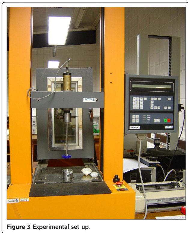
Figure 3 Experimental set up.